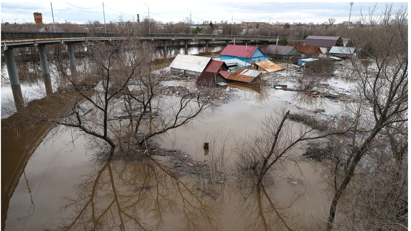
Piles of flood debris float in the neighborhood of Sittsovka in Orenburg.