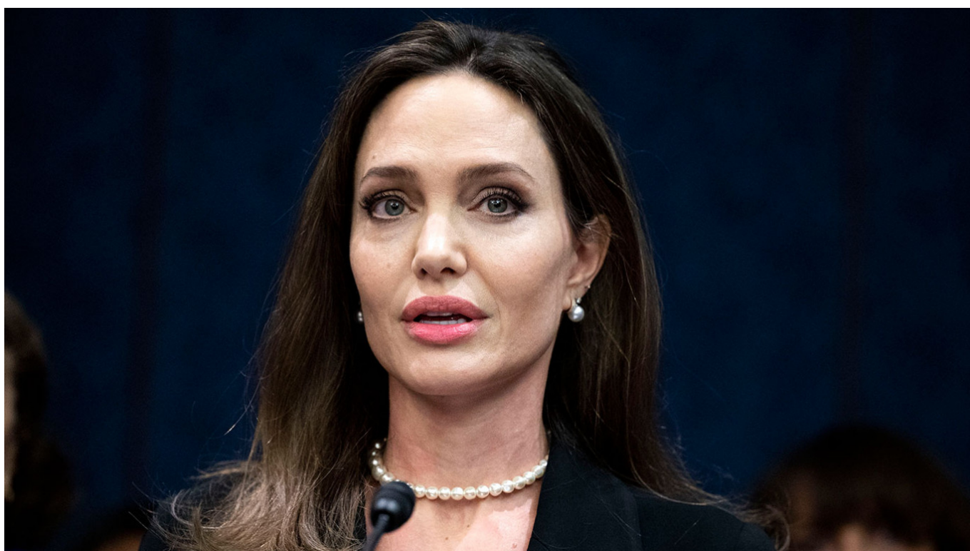
Angelina Jolie.

Since Putin unleashed Russia's war on Ukraine on Feb. 24, a number of Hollywood celebrities have publicly condemned Russia's actions. Through Instagram posts, heartfelt speeches or raising funds for Ukrainian victims, Hollywood celebs seem to have come together to help the war-torn country.