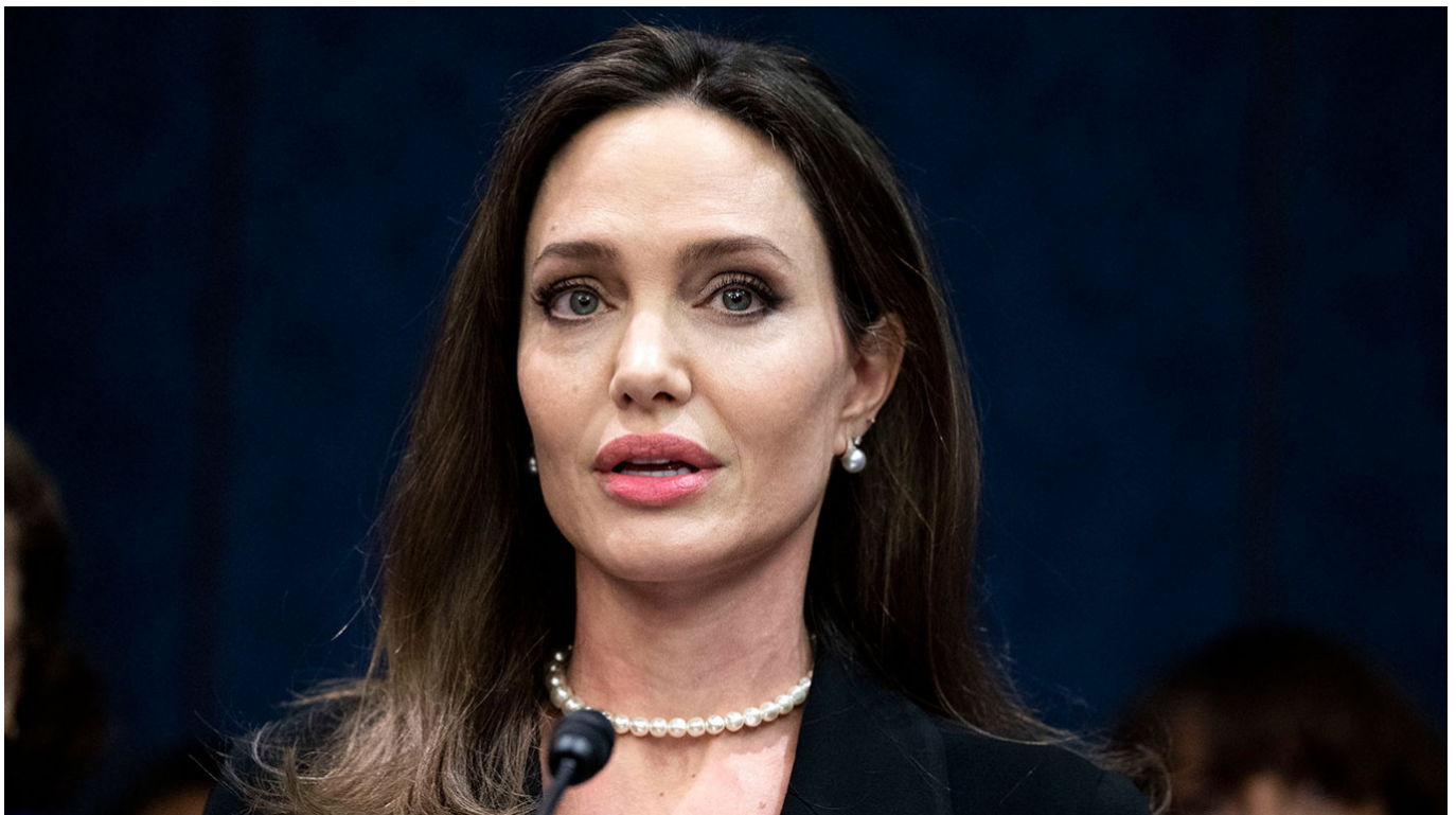
Angelina Jolie.

Since Putin unleashed Russia's war on Ukraine on Feb. 24, a number of Hollywood celebrities have publicly condemned Russia's actions. Through Instagram posts, heartfelt speeches or raising funds for Ukrainian victims, Hollywood celebs seem to have come together to help the war-torn country.