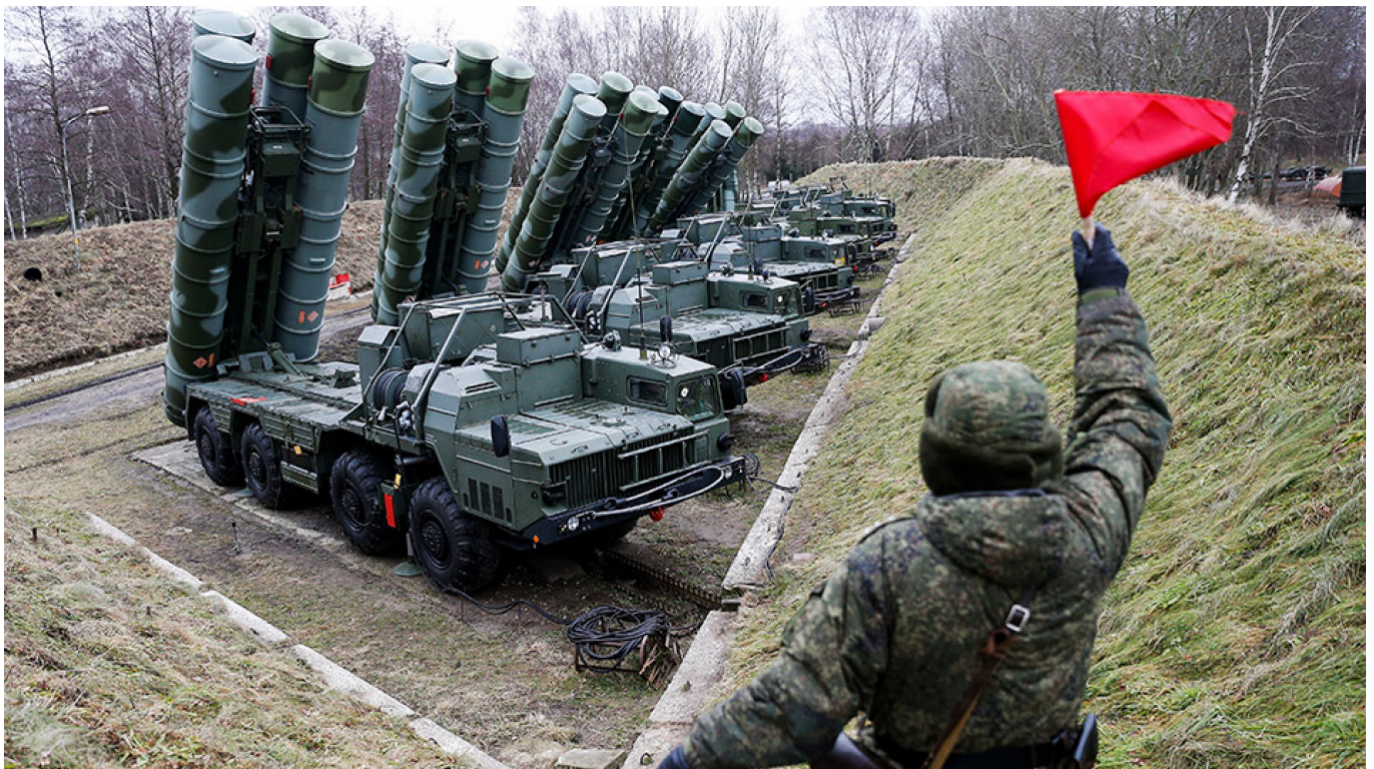
S-400 missile defense systems