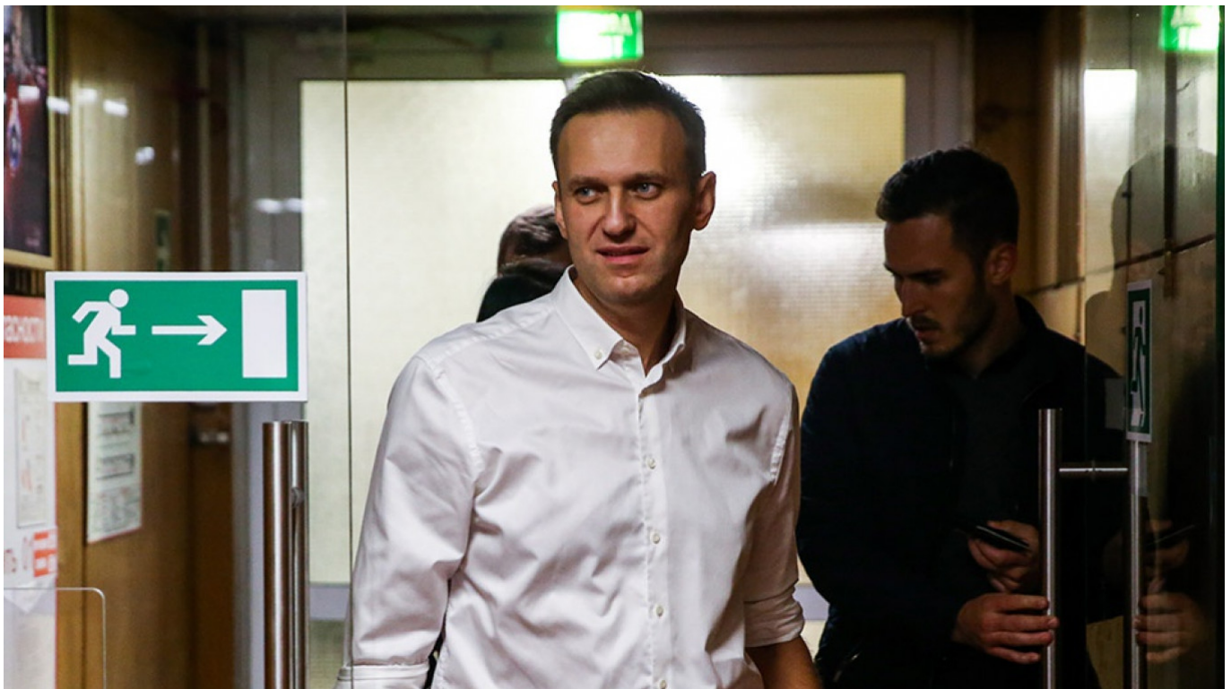
Alexei Navalny

Update: Navalny reported Wednesday morning that he had been allowed to leave the country after paying a 2.1 million ruble court fine that had formally barred him from leaving Russia. The activist insists that he had not been informed of the fine when it was posted on Nov. 9 and has vowed to sue the Federal Court Marshals Service over what he called "illegal actions."