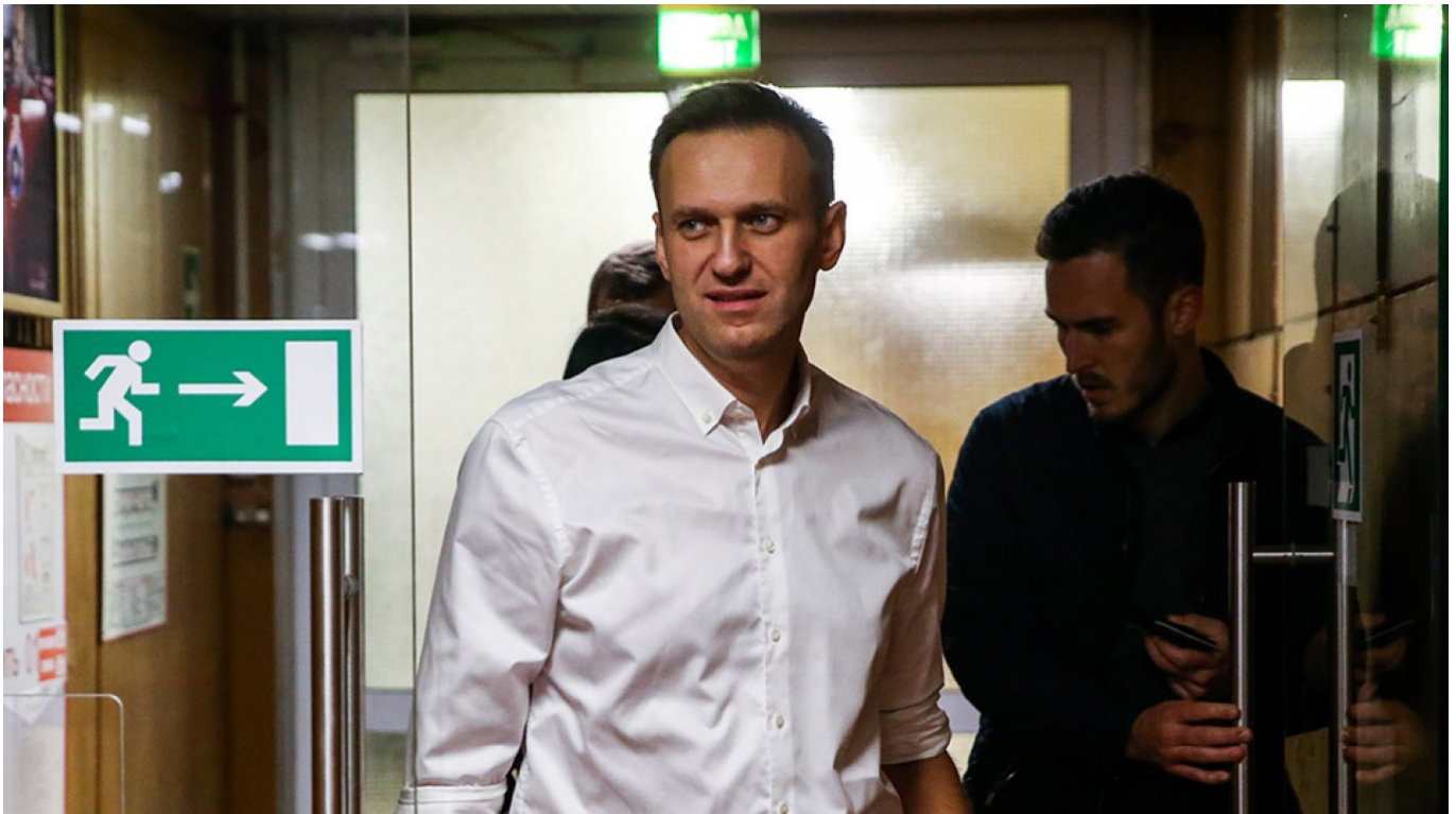
Alexei Navalny

Update: Navalny reported Wednesday morning that he had been allowed to leave the country after paying a 2.1 million ruble court fine that had formally barred him from leaving Russia. The activist insists that he had not been informed of the fine when it was posted on Nov. 9 and has vowed to sue the Federal Court Marshals Service over what he called "illegal actions."