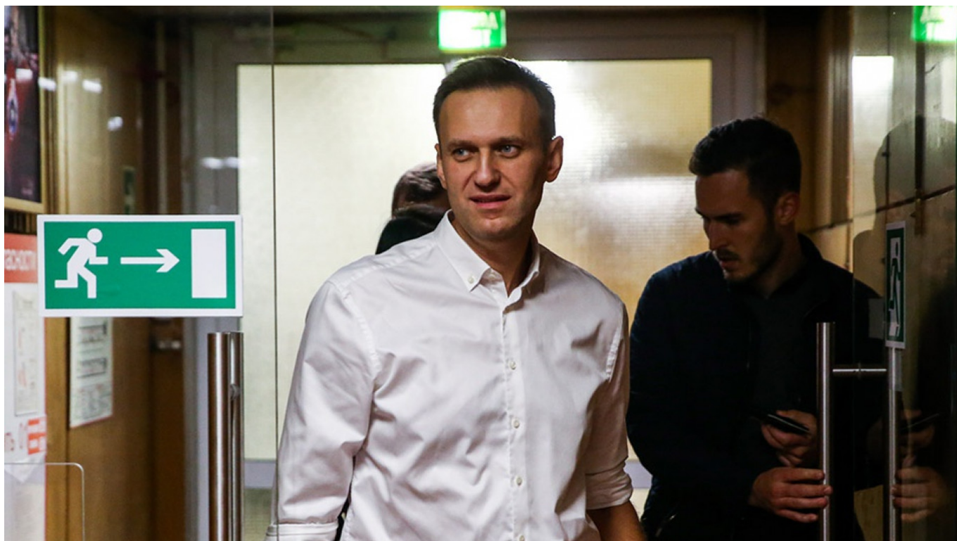
Alexei Navalny

Update: Navalny reported Wednesday morning that he had been allowed to leave the country after paying a 2.1 million ruble court fine that had formally barred him from leaving Russia. The activist insists that he had not been informed of the fine when it was posted on Nov. 9 and has vowed to sue the Federal Court Marshals Service over what he called "illegal actions."