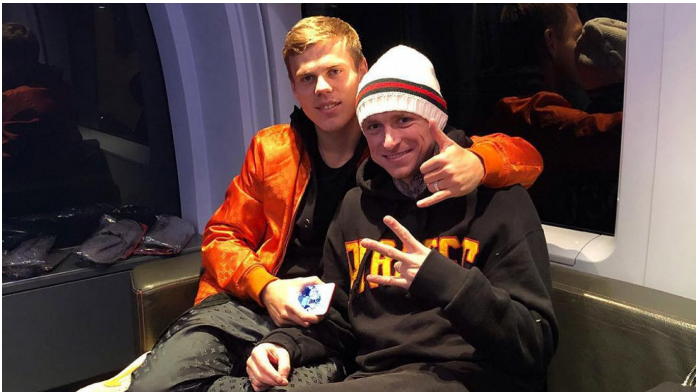
Alexander Kokorin and Pavel Mamayev

Two Russian footballer players implicated in past scandals have come under investigation this week for initiating two fights in Moscow, including a racist assault on a federal official.