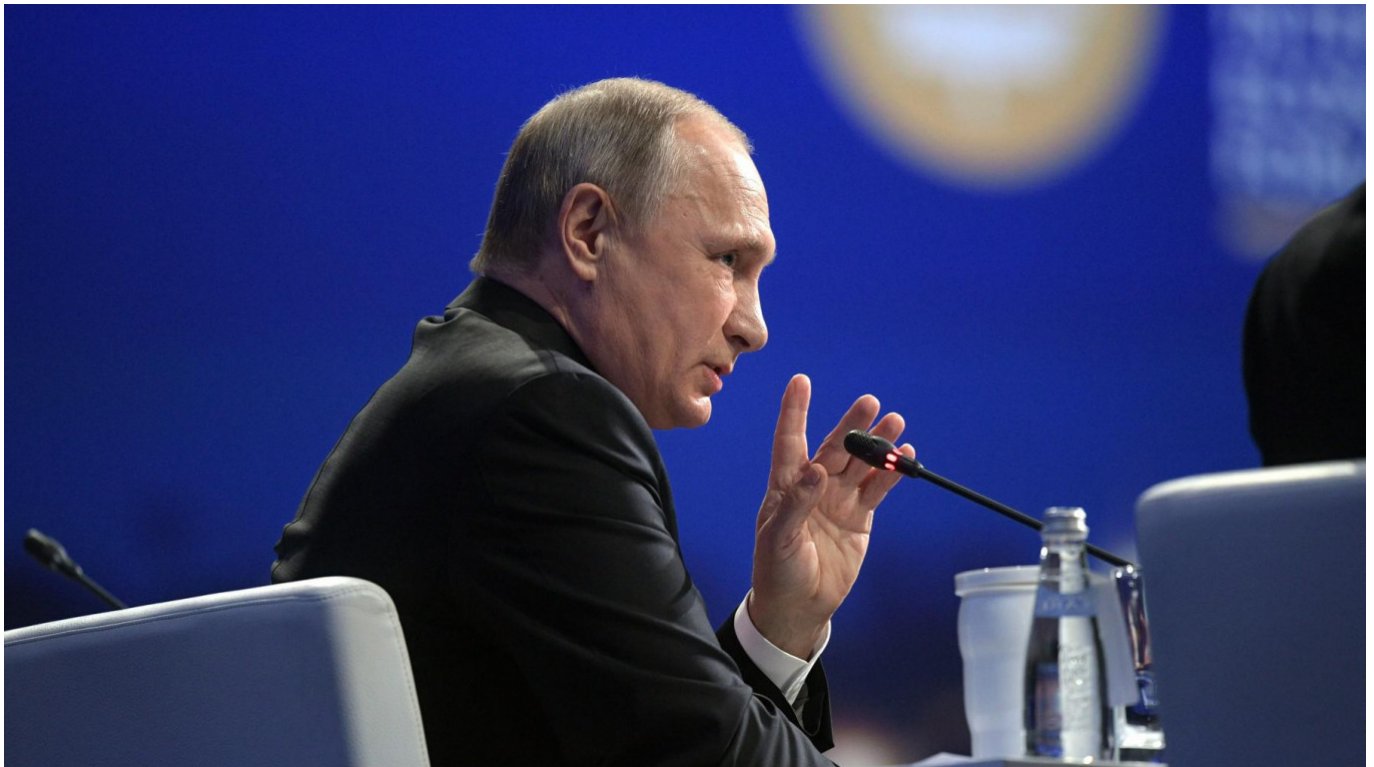
Vladimir Putin

Russian media has found a way to give a positive twist to a new survey produced by the Pew Research Center reporting low trust in Russian President Vladimir Putin globally.