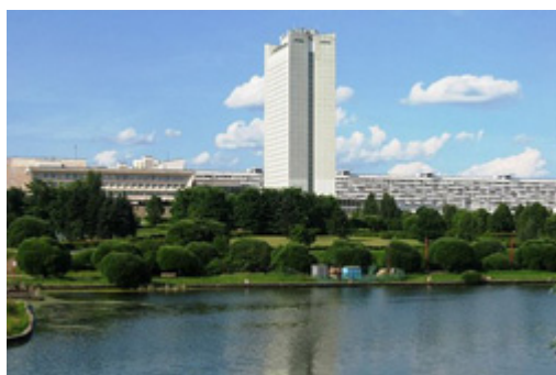
Bolshoi Gorodskoi Prud