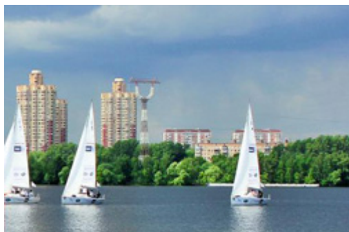
Royal Bar Beach Club