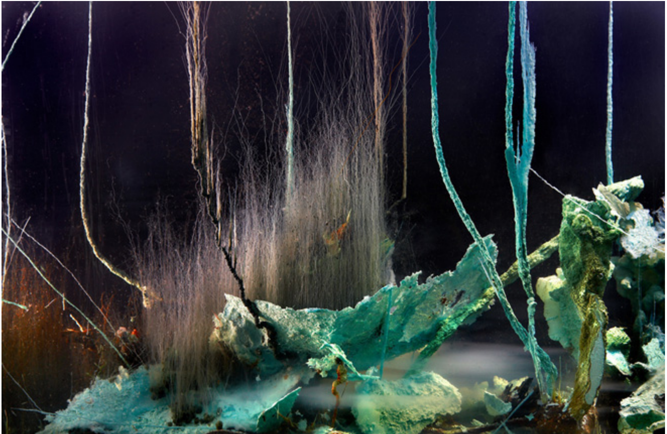
Kamel Mennour gallery