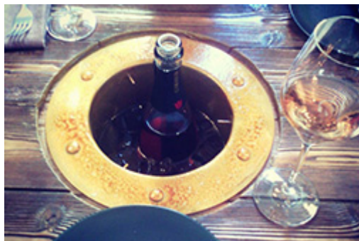
Hamlet + Jacks