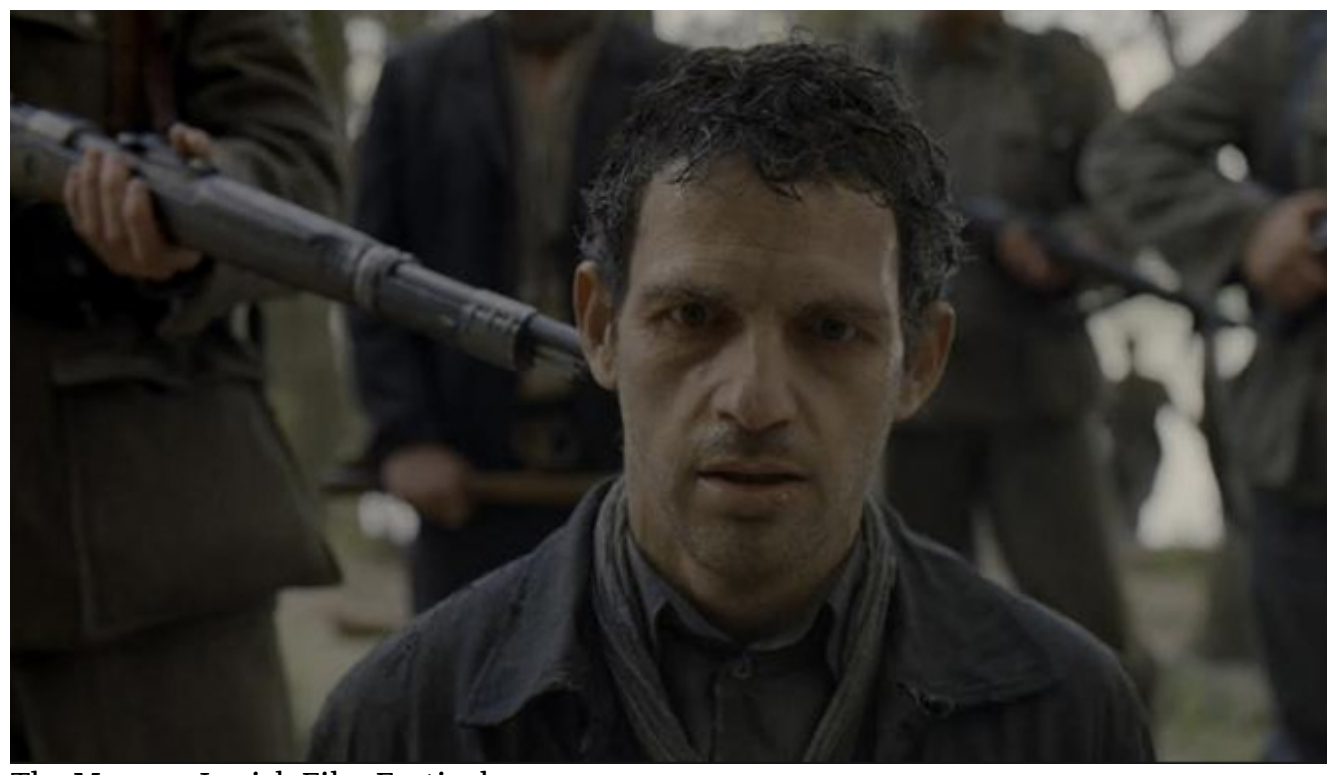
The Moscow Jewish Film Festival