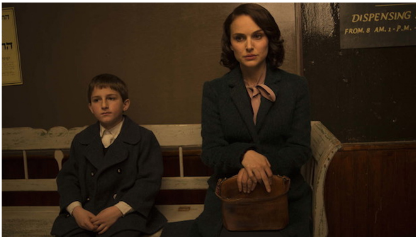
The Moscow Jewish Film Festival