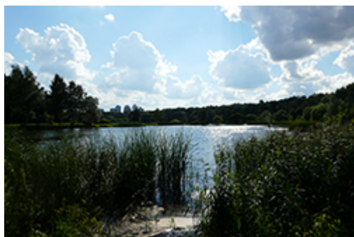
Feudorgrigoriev / Wikicommons

This nature lover's paradise offers beautiful walks through linden trees, overgrown romantic alleys, and a cascade of ponds by the river Chernushka. An 18th century manor, orangery, greenhouses, elegant fencing, ponds and several beaver dams add to the charm. The numerous shashlik areas within the park are completely free to use and are popular with locals throughout the summer season.