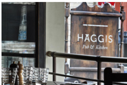
Haggis Pub & Kitchen