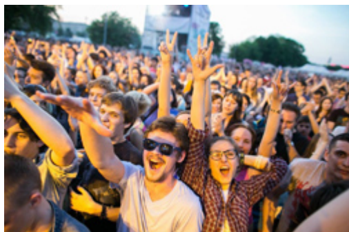
Bosco Fresh Fest

Bosco Fresh Fest has moved to VDNKh and expanded to three stages. The first day’s headliners are Mumiy Troll, probably the most popular Russian rock band and New York hip-hop diva Azealia Banks. On the second day you can check out Ivan Dorn’s new concert program with a Dixieland band and Tesla Boy. You can also see Skriptonit, a rising rap star from Kazakhstan and Brainstorm from Latvia, as well as electronic pioneers GusGus from Iceland and Kwabs, British Ghanaian singer, who authored ubiquitous hit “Walk.” Moscow indie scene regulars On-the-Go, Pompeya, and Tesla Boy will be there as well.