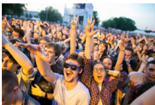
Bosco Fresh Fest

Bosco Fresh Fest has moved to VDNKh and expanded to three stages. The first day’s headliners are Mumiy Troll, probably the most popular Russian rock band and New York hip-hop diva Azealia Banks. On the second day you can check out Ivan Dorn’s new concert program with a Dixieland band and Tesla Boy. You can also see Skriptonit, a rising rap star from Kazakhstan and Brainstorm from Latvia, as well as electronic pioneers GusGus from Iceland and Kwabs, British Ghanaian singer, who authored ubiquitous hit “Walk.” Moscow indie scene regulars On-the-Go, Pompeya, and Tesla Boy will be there as well.