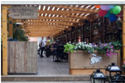
Wing or Leg