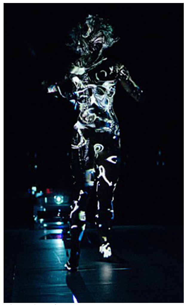
The Polytech Museum

Entrance to the festival is free, but for some of the events you need to pre-register or buy tickets. For a full program and registration, see <u>fest.polymus.ru/en.</u>