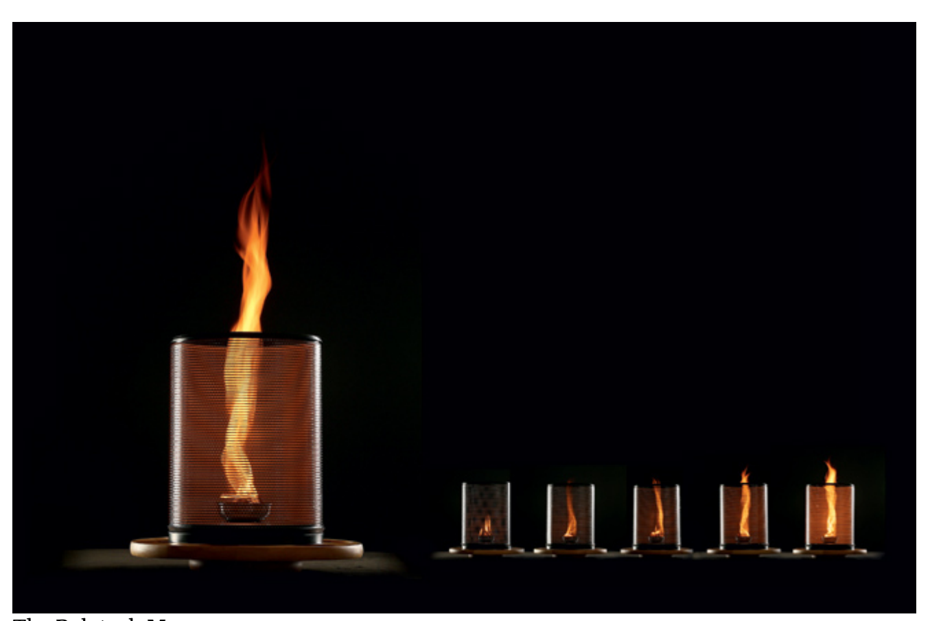
The Polytech Museum

May 21 and May 22, 11:00 a.m. until 8:00 p.m.