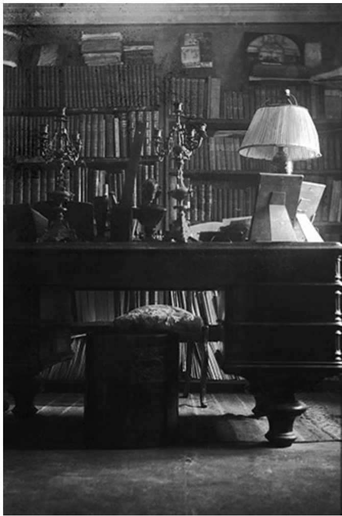
The Bulgakov Museum

Mikhail Bulgakov's study in the apartment on Bolshaya Pirogovskaya Ulitsa