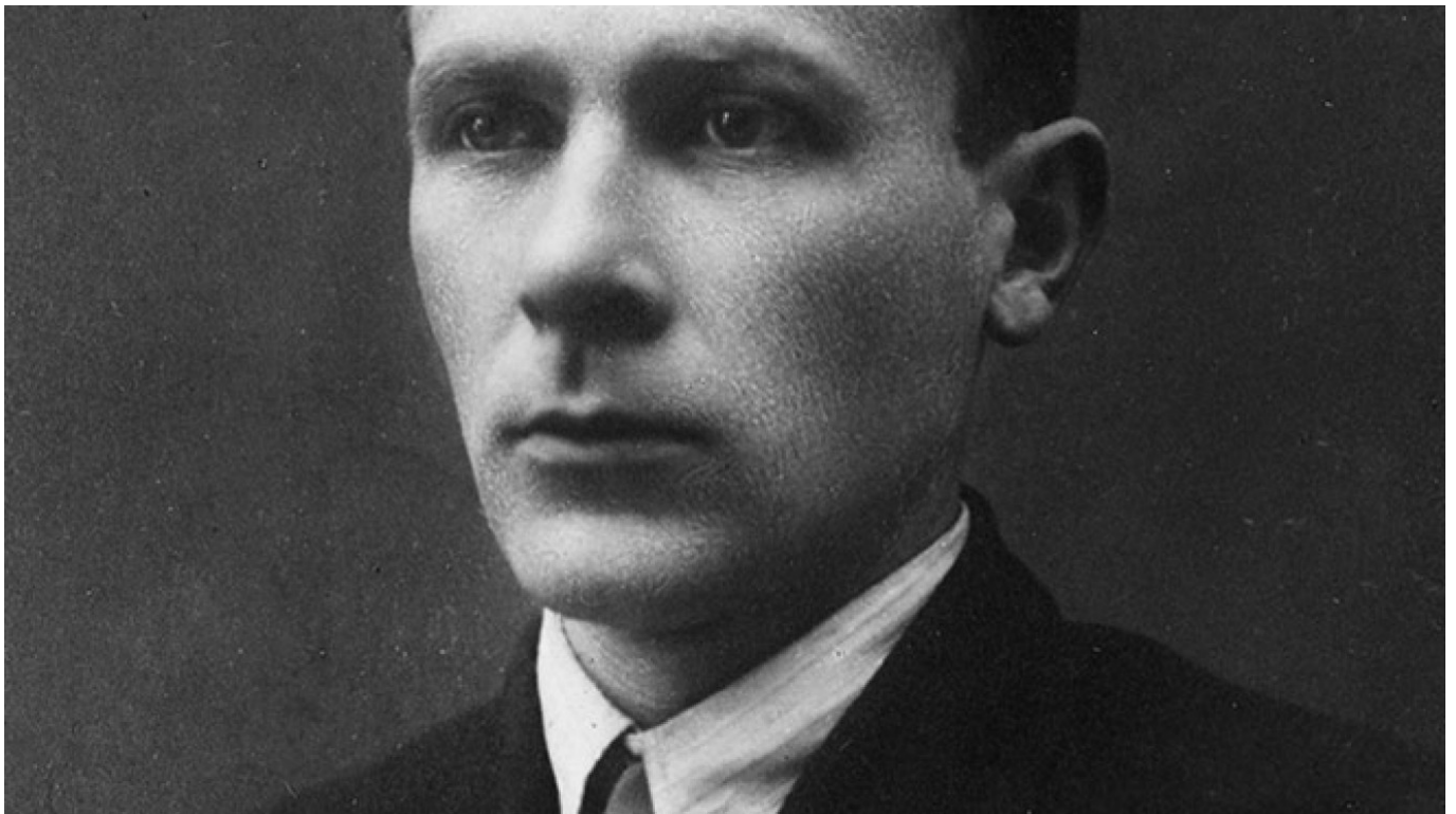
A photo of a young Mikhail Bulgakov

Seeing no future as a writer in the Soviet Union, in 1930 Bulgakov burned the first manuscript of "The Master and Margarita" at his apartment on Bolshaya Pirogovskaya Ulitsa. Little did he know the millions of readers he would enchant, delight and captivate with his tale of the devil visiting Moscow. Now one of the nation's best-loved writers, Bulgakov's former apartment has opened to the public for the first time with a brand new exhibition dedicated to his life and works.