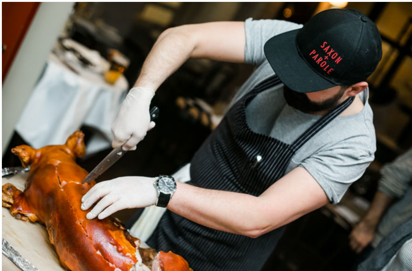
Saxon + Parole

The night's main event was Steve, a suckling pig born and raised in central Russia.