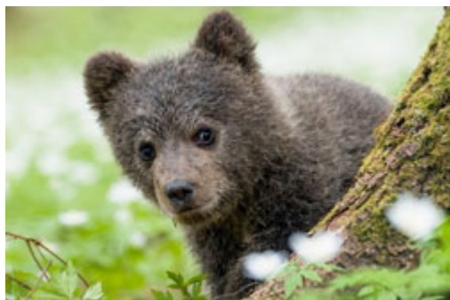
Michael Korostelev / Primordial Russia

A new exhibition at the Gallery of Classical Photography displays images from Russia's leading wildlife photographers. Over 70 photographs are on show, featuring images of the country's most remote landscapes, beautiful scenery and extraordinary wildlife.