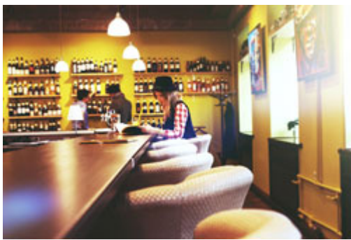
45 Bar and Cafe