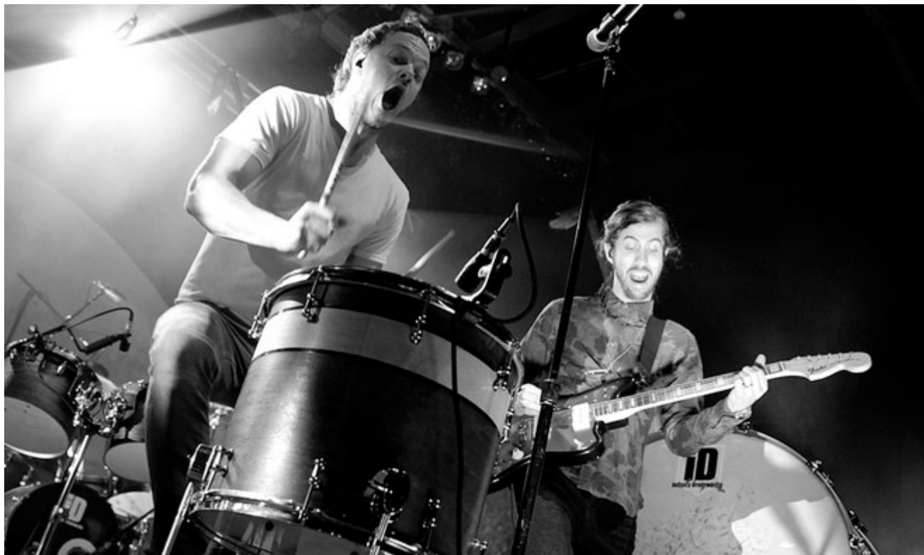
Derek Schwartz / Wikicommons