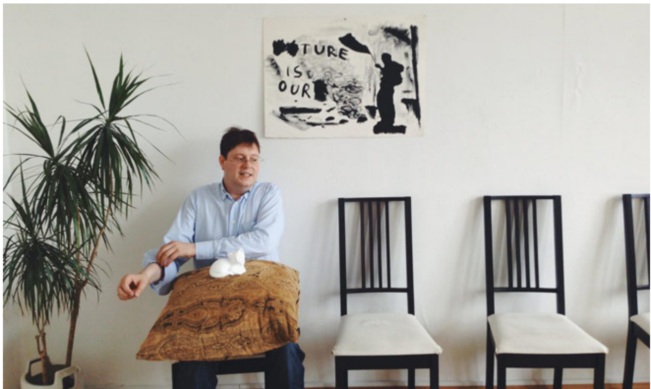
White Walls Problems — Facebook

"These cities and their history are an integral part not just of Russian culture, but also of European and world heritage," he says. "And sometimes, to put a place back on the map, it is better to send an artist than an economist or a cartographer. Artists have no hidden agenda, they are able to look around with fresh eyes."