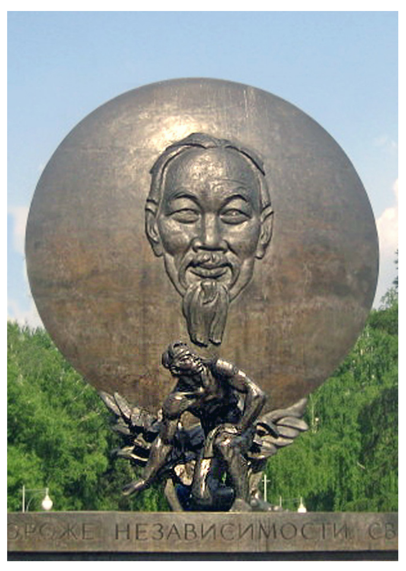
Right in the center of Moscow, on Chistoprudny Boulevard, is a monument to Kazakh writer Abai Kunanbaev. It was donated to Russia by the Republic of Kazakhstan in 2006. Kunanbaev