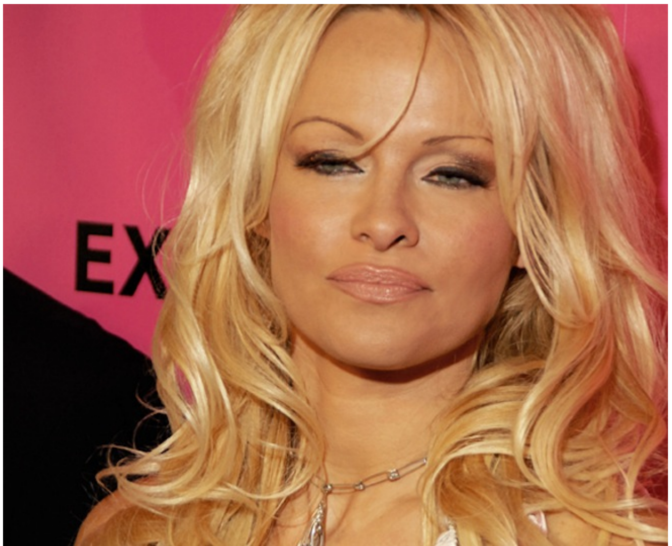
Toglenn / Wikicommons