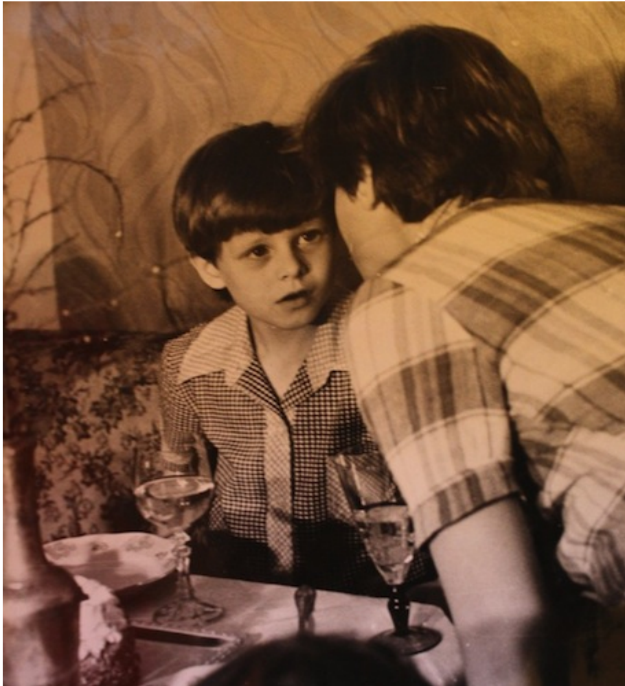
Daisy Sindelar / RFE

My grandparents used to joke that if you lived long enough, you could live in five different countries without ever leaving your village: the Austro-Hungarian Empire, Czechoslovakia, Hungary, the U.S.S.R., and Ukraine.