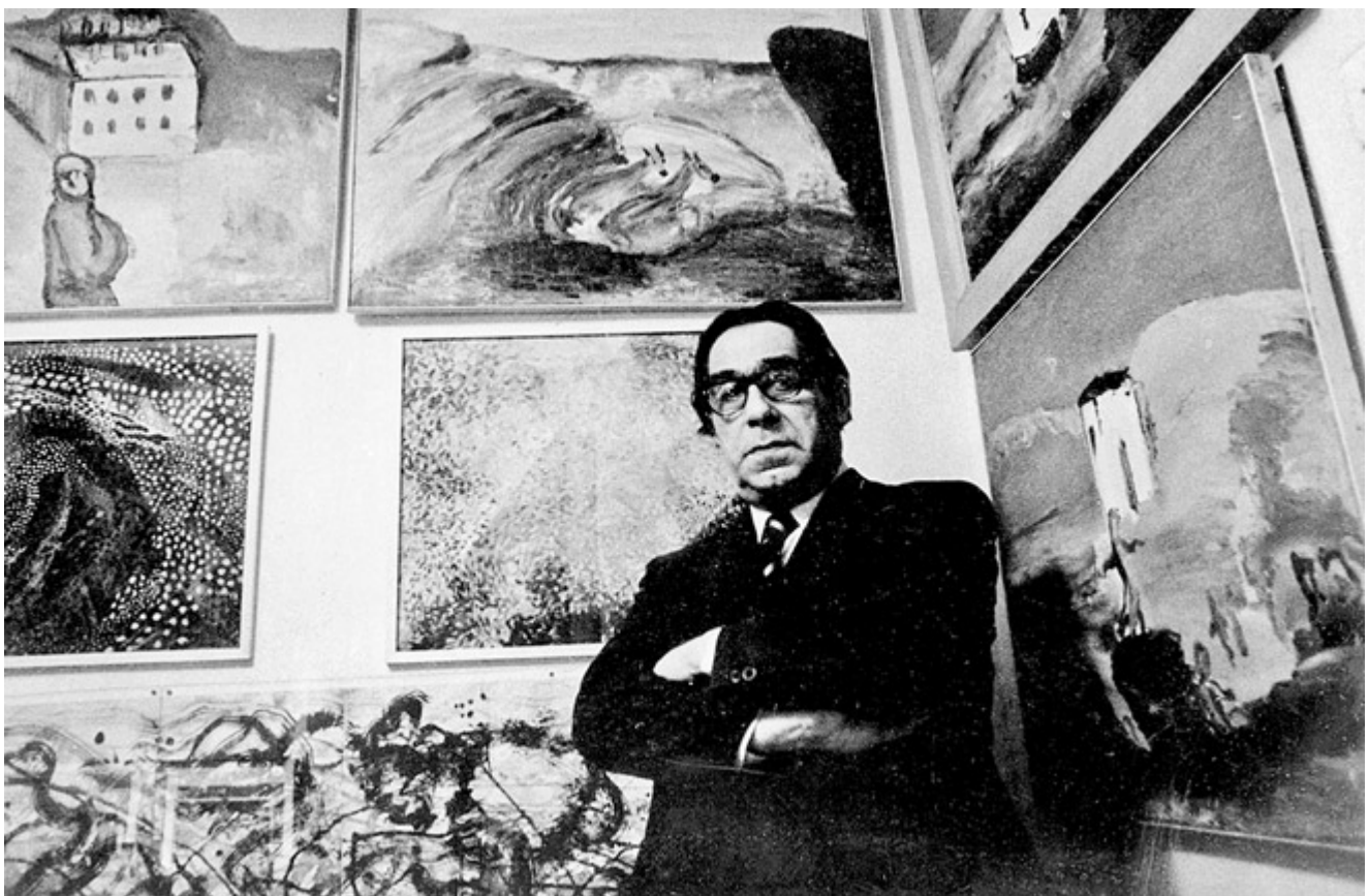
State Tretyakov Gallery

Costakis then scoured the country for modernist masterpieces, tracking down famous artists like Alexander Rodchenko and Varvara Stepanova, who had fallen out of state favor.