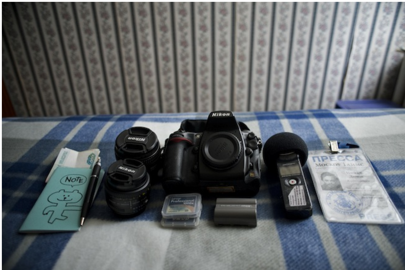
Pascal Dumont / MT