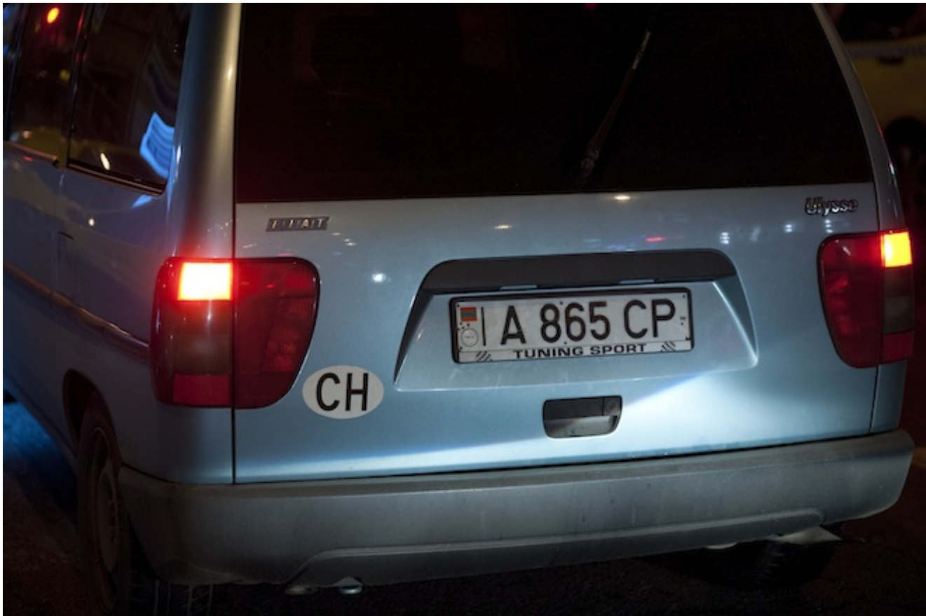
Pascal Dumont / MT

One of the most interesting moments of the night was when I met a taxi driver from Moldova's self-proclaimed Transdnestr republic.