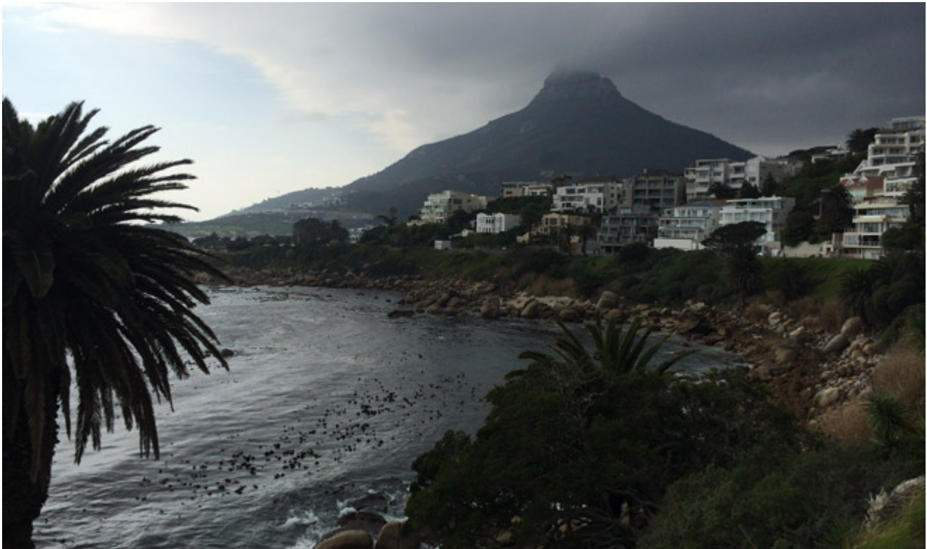
Kristen Blyth / For MT

South Africa, so far, lacks the legal hassle of foreign property purchasing found in other countries — and buyers appreciate that. "They [foreigners] are free to bring their money in and take their money out as they wish, which is Plus No. 1," Miller said. "It's an easy country. We're very accommodating."