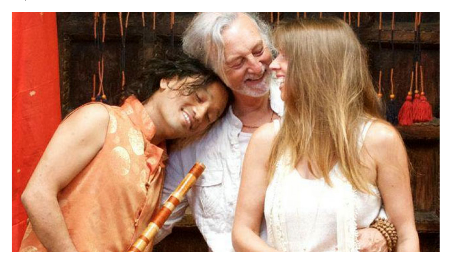
Deva Premal, right, puts ancient Sanskrit texts in New Age compositions.

The holidays are over, ladies and gentlemen — hopefully, you've had a chance to relax, kick back, maybe even go on a brief vacation and generally recharge. You're going to need all the energy you can muster, as spring is in full swing and there are exciting things happening in our fair capital every day. And it also means that the concert season is really kicking off: This weekend is the perfect example of a great lineup, so listen up and get ready to have some fun!