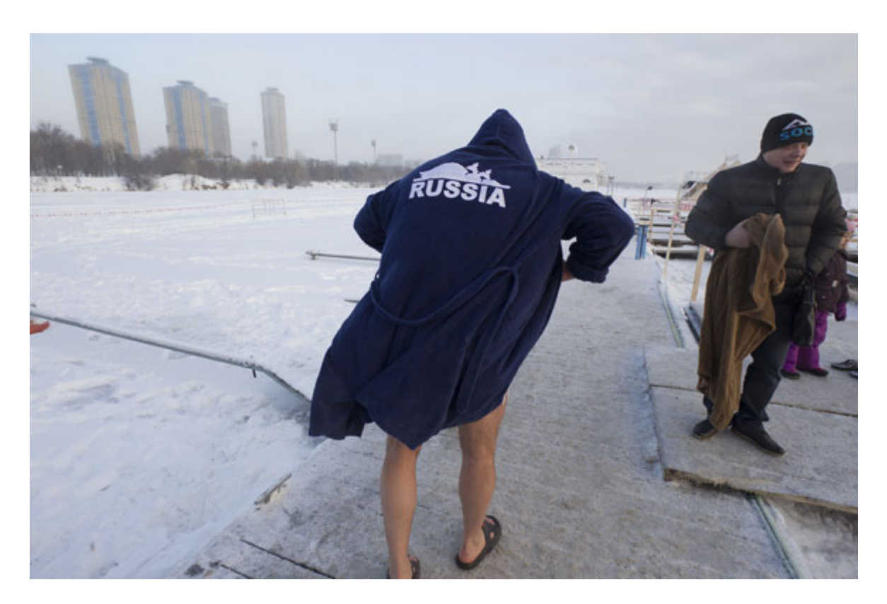
More than 100.000 people took part in Epiphany celebrating.