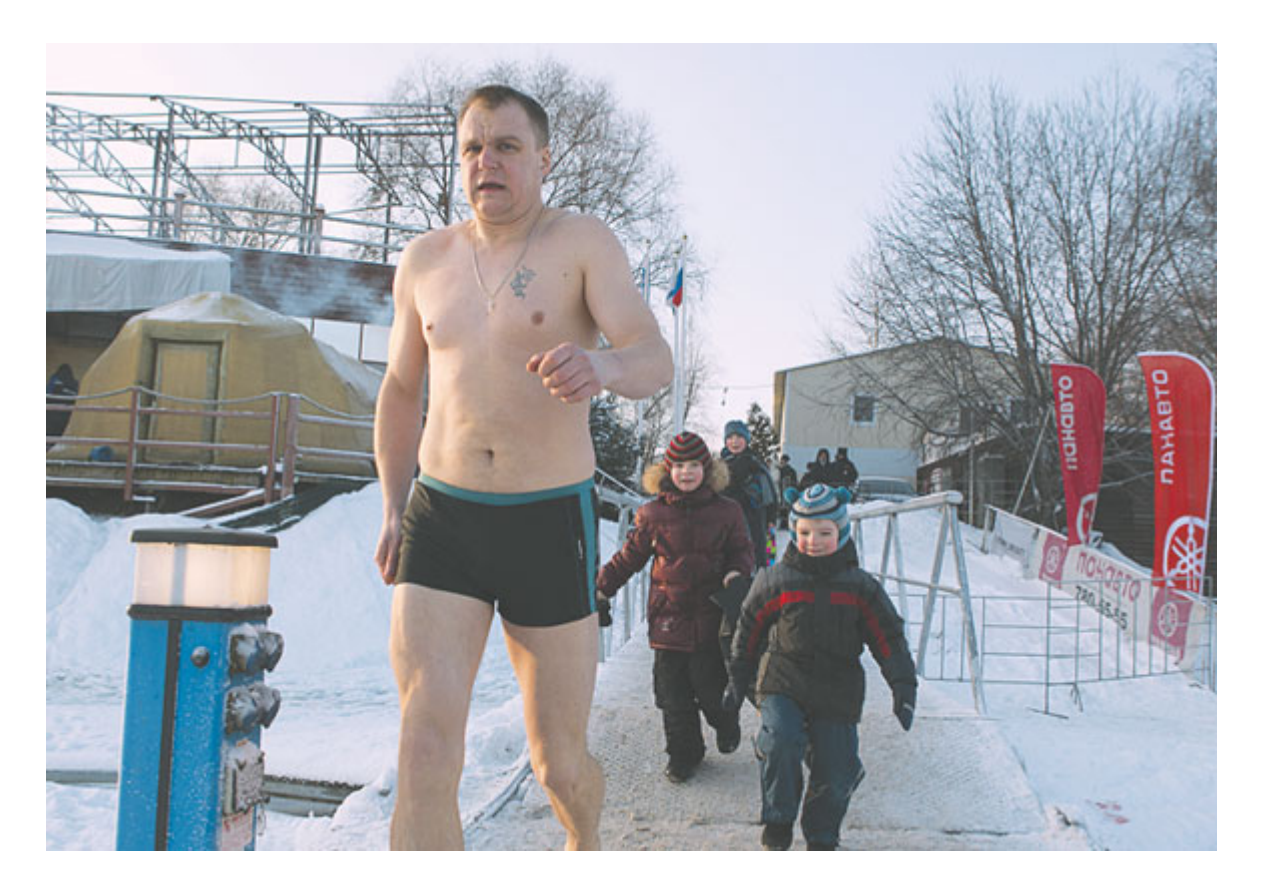
A man is getting ready to dive into a cold water.