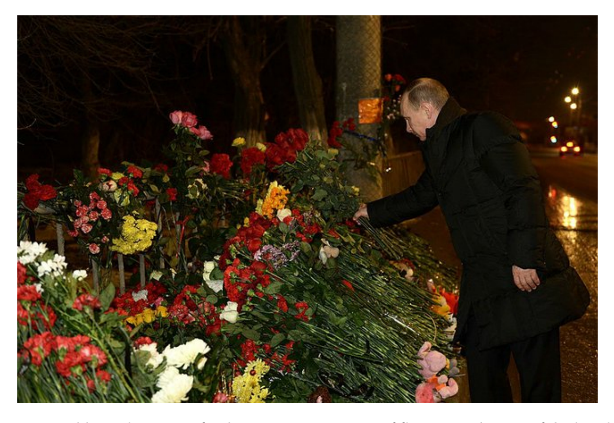
Putin adding a bouquet of red roses to a mountain of flowers at the site of the bomb attack.

Volgograd was the site of major battle in World War II and a landmark victory over the Nazis that turned the tide of the war and many residents take pride in their city's heroic past.