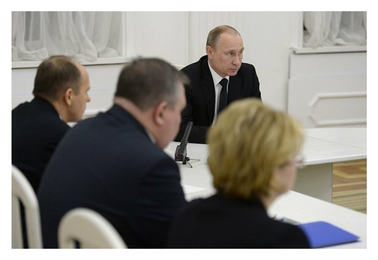
Putin discussing anti-terror measures in the wake of the Volgograd attacks at a meeting with top officials.

The police searched the basements and attics of more than 2,700 apartment buildings, inspected more than 100 parking lots and two dozen bus terminals in a move to tighten security after the two bombings that latest reports say killed 34 people and injured about 70 others.