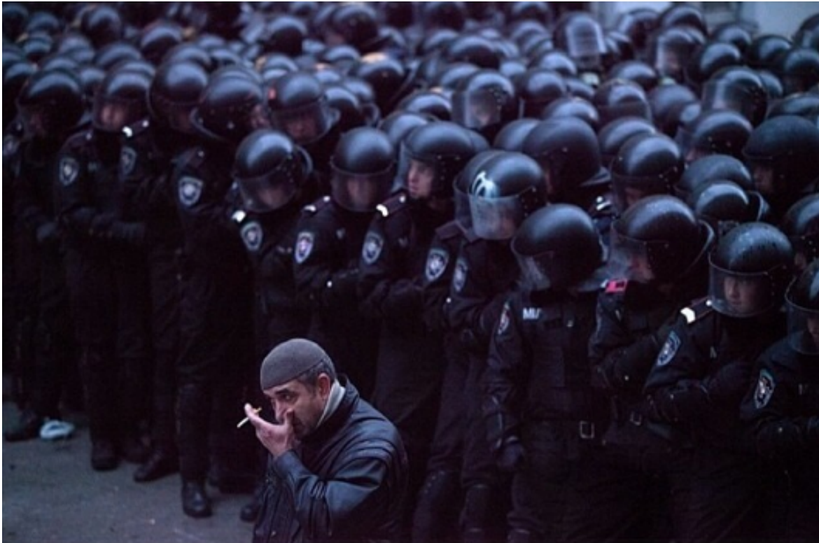
A man smoking, oblivious of the police cordon that has formed behind him.