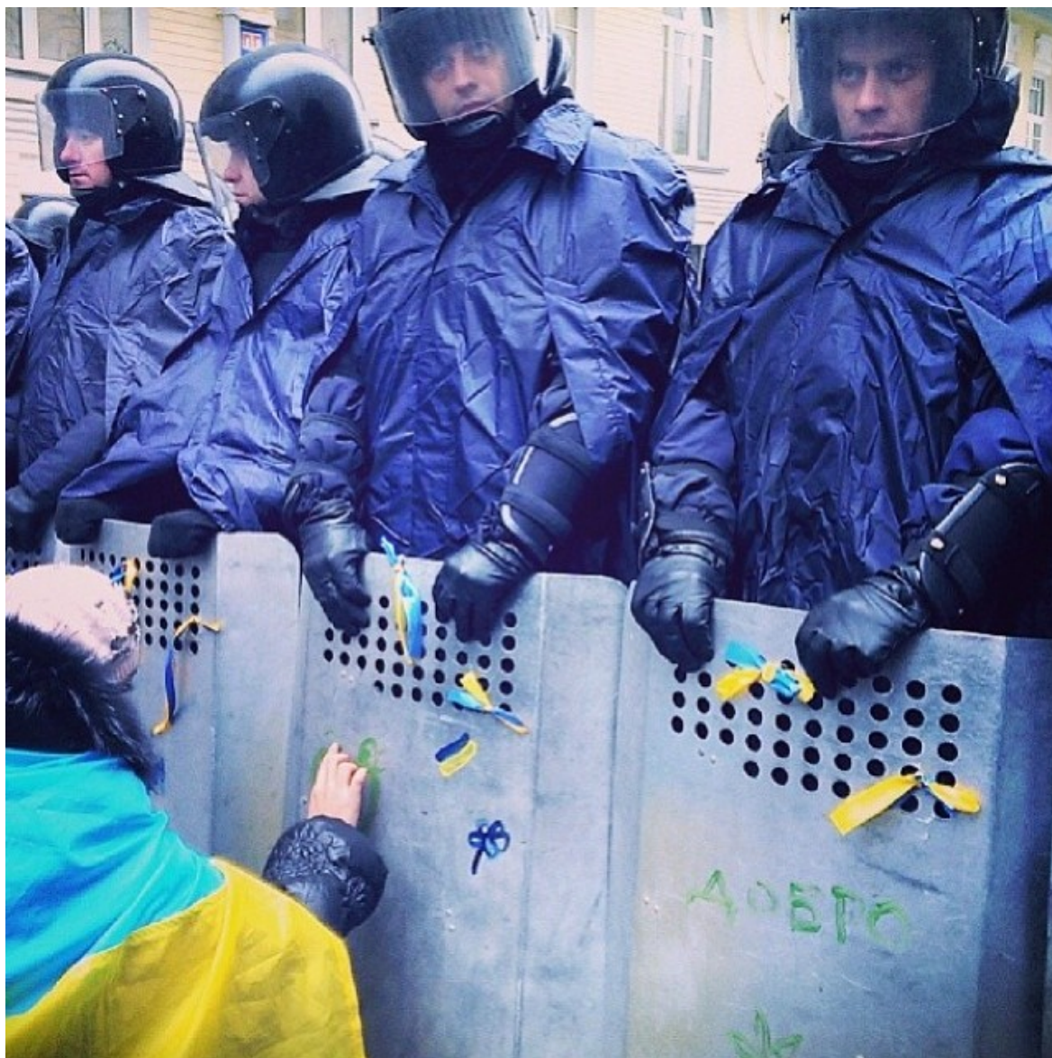
Police allowing a protester to decorate their riot shields.