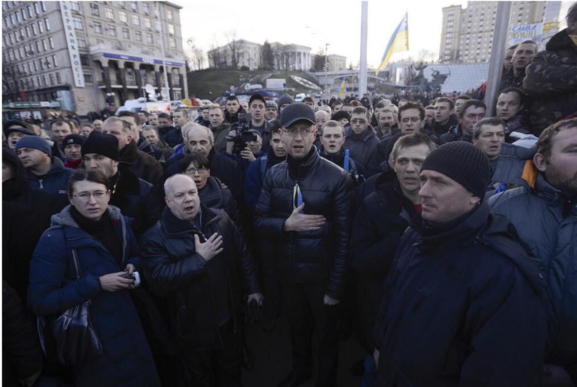
Arseniy Yatsenyuk, leader of the parliamentary faction "Fatherland" and former foreign minister with activists singing the national anthem on Monday.