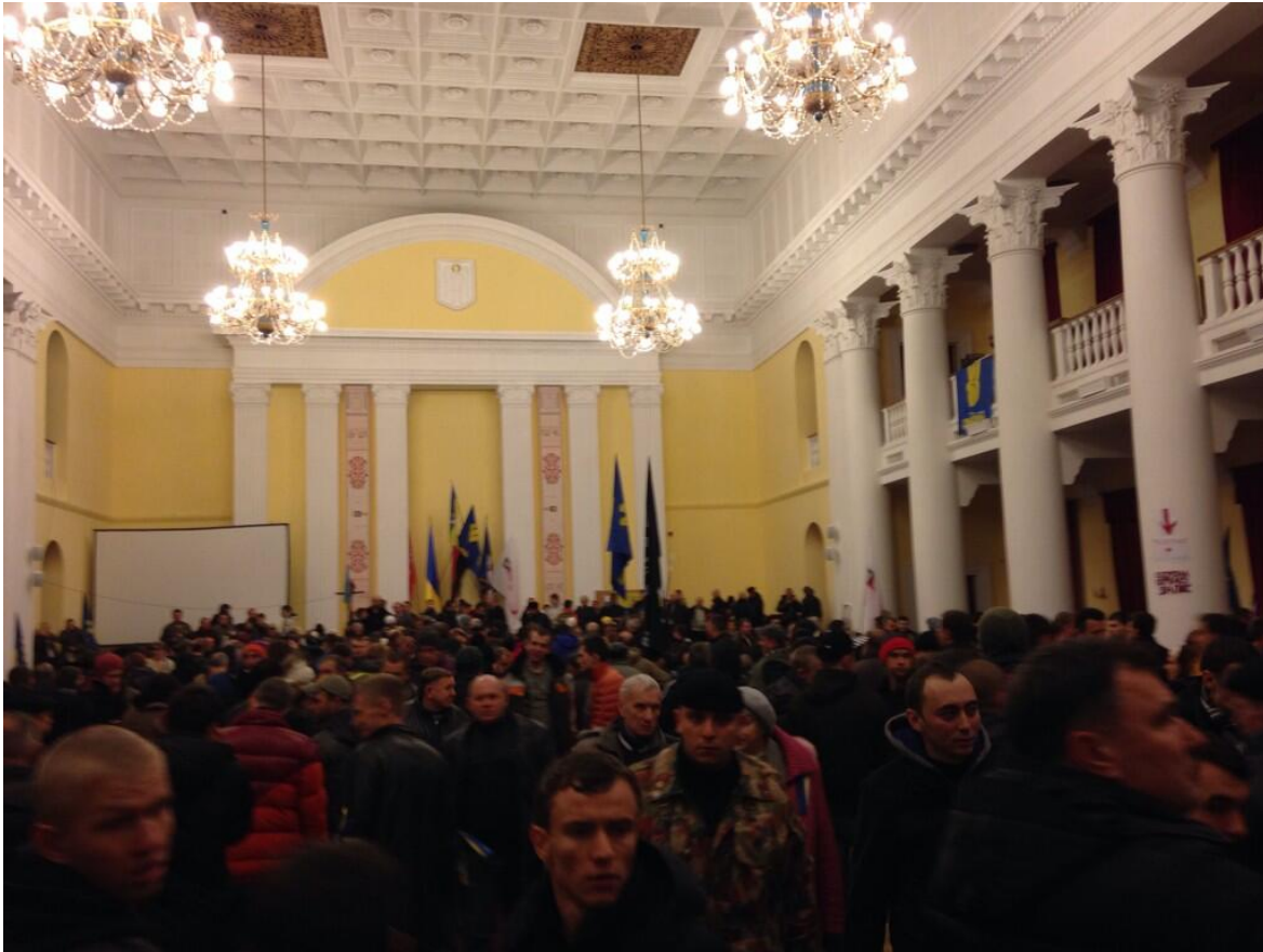
Inside Kiev City Hall, protesters were sleeping, handing out food and wandering around after occupying the building on Sunday.