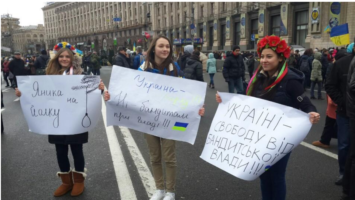
Protesters holding signs disapproving of Yanukovych.