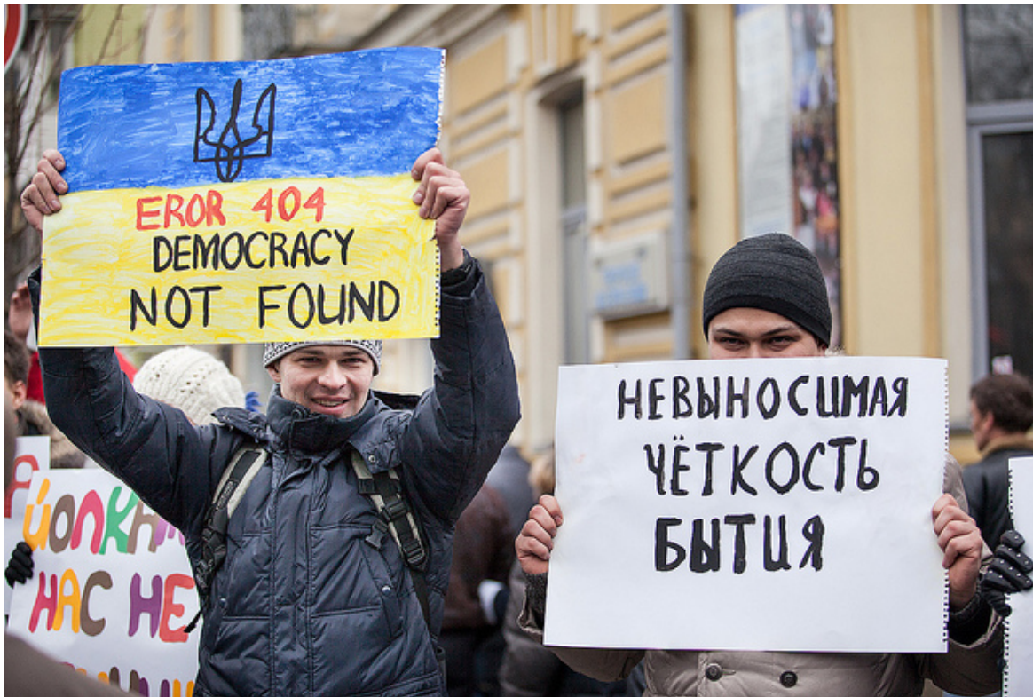
Protesters and their homemade signs.

Edit – A photo that incorrectly identified the Ukrainian president was removed from the photo essay.