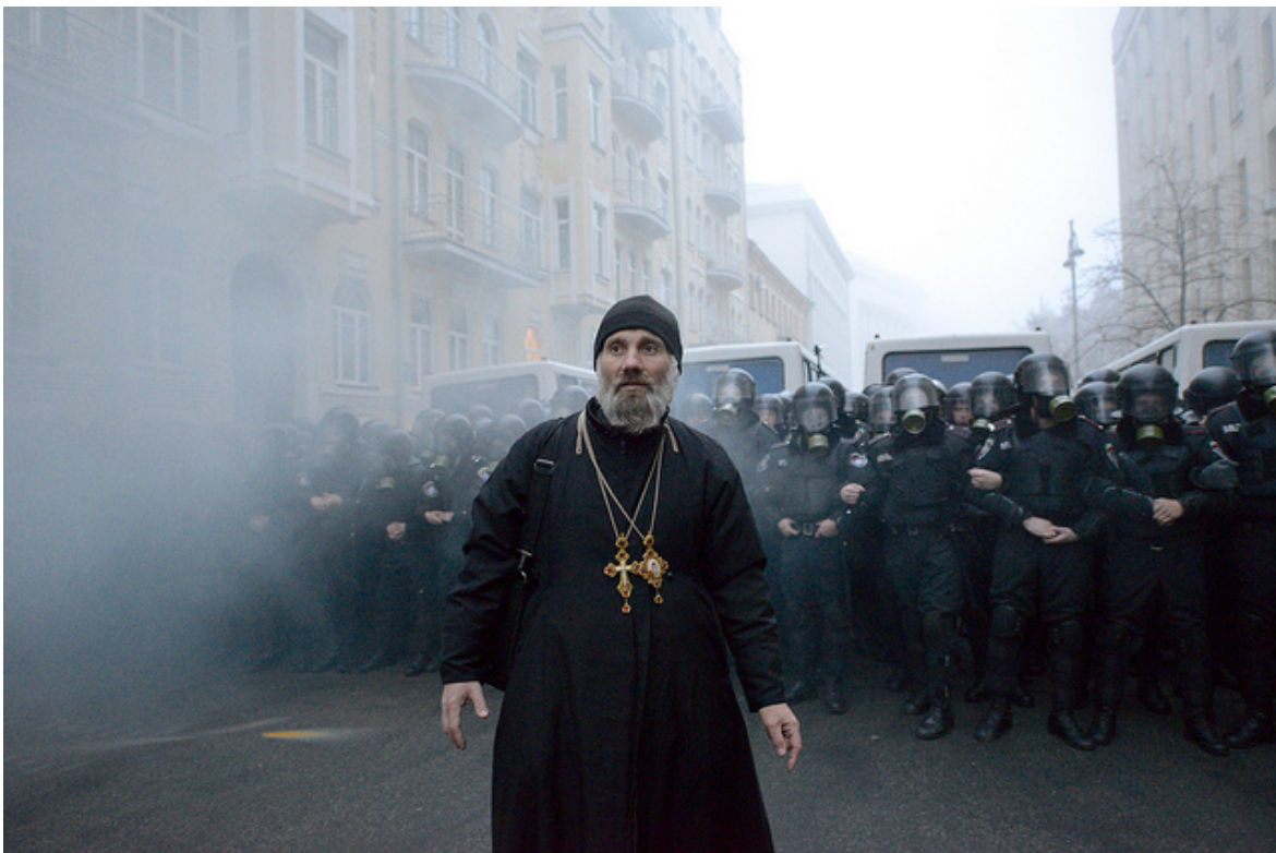
A priest looking disoriented as a result of a smoke grenade.