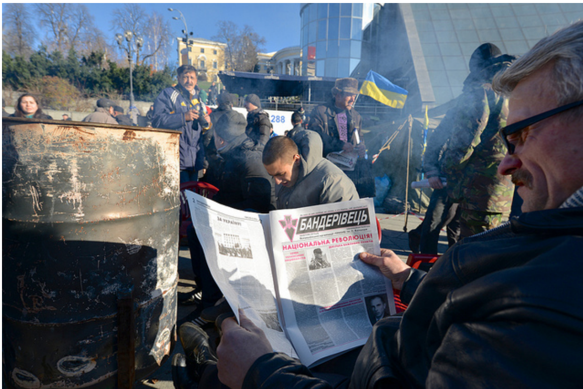
While keeping warm at the protest campsite, a man reads a revolutionary newspaper.