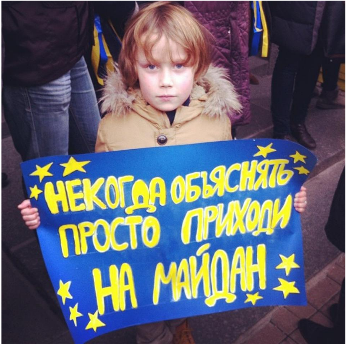
A young protester with a picket that tells people to "just go" to Maidan Nezalezhnosti.