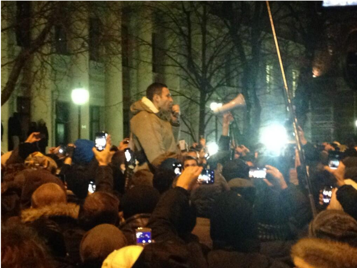
World champion boxer-turned-politician Vitaly Klitschko speaking to the crowd on Sunday night.