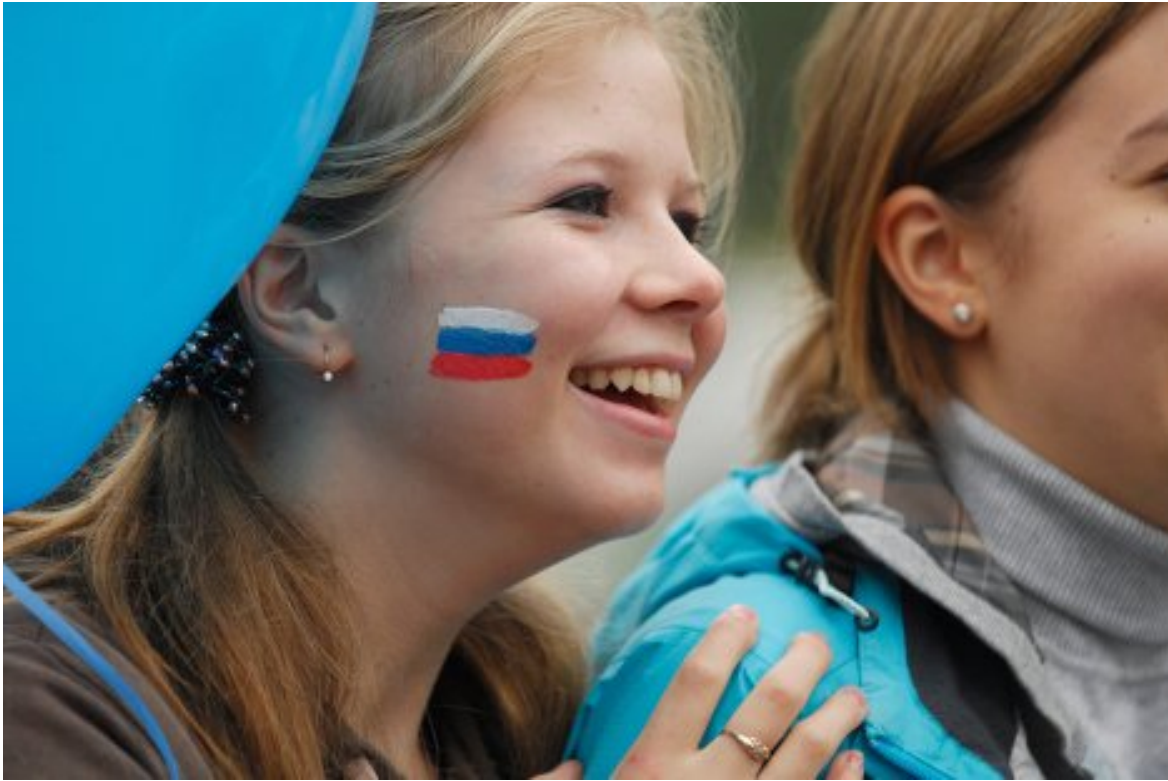
Young Russians at a street parade organized by the Young Guard, the youth wing of the United Russia party, to mark National Unity Day.

2. It commemorates Russia's defeat of Polish invaders 1612, when the people's volunteer army led by Kuzma Minin and Dmitry Pozharsky liberated Moscow from interventionist forces.