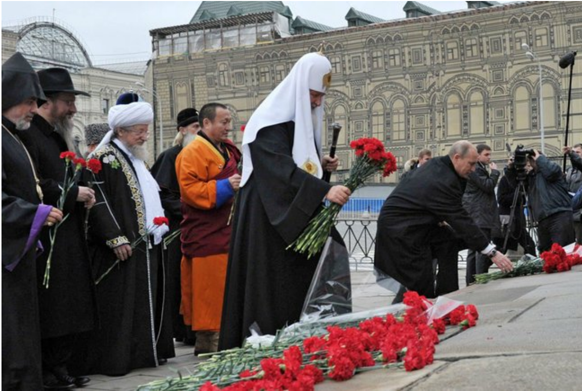
Putin with religious leaders and representatives of youth organizations taking part in a flower-laying ceremony to mark National Unity Day in 2012.