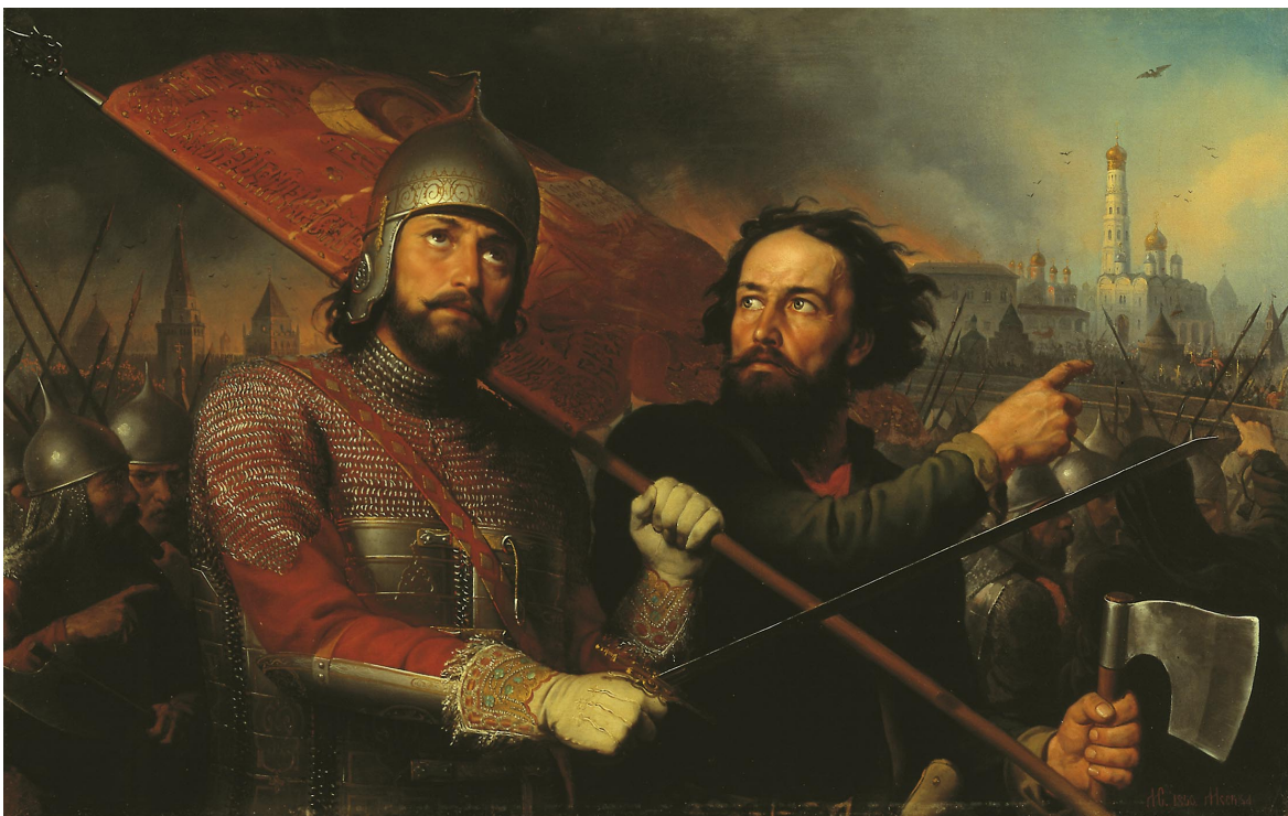
Pozharsky (left) and Minin in a 19th-century painting of the battle of Moscow by Mikhail Scotti.

2. It commemorates Russia's defeat of Polish invaders 1612, when the people's volunteer army led by Kuzma Minin and Dmitry Pozharsky liberated Moscow from interventionist forces.