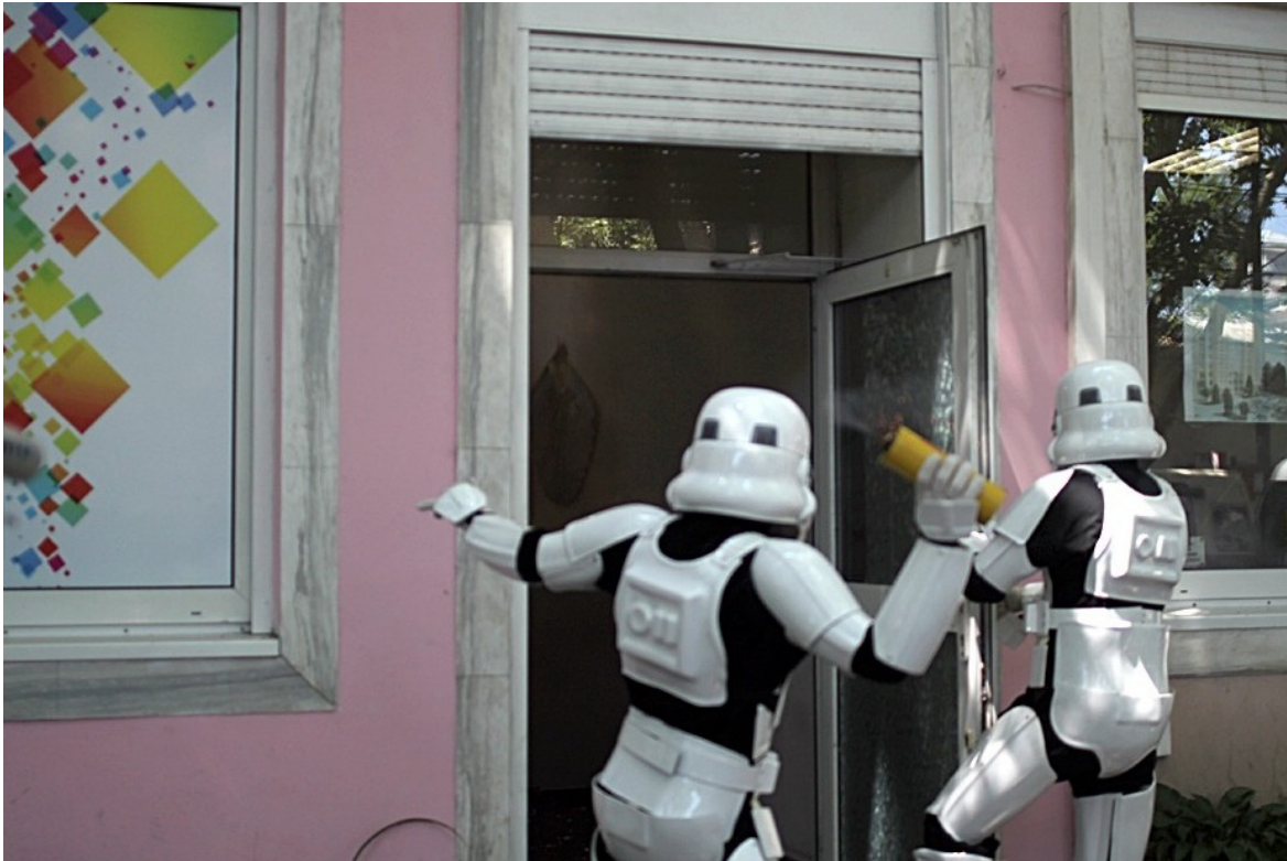
The vigilantes attacking the smoke shop, submitted by users of the news service Dumskaya.

In their own fight against the dark side, a squad of rogue intergalactic stormtroopers from the collective known as the Internet Party of Ukraine, raided a cafe in Odessa earlier in 2013 in search of illegal herbal drugs, throwing smoke bombs and setting the venue on fire.