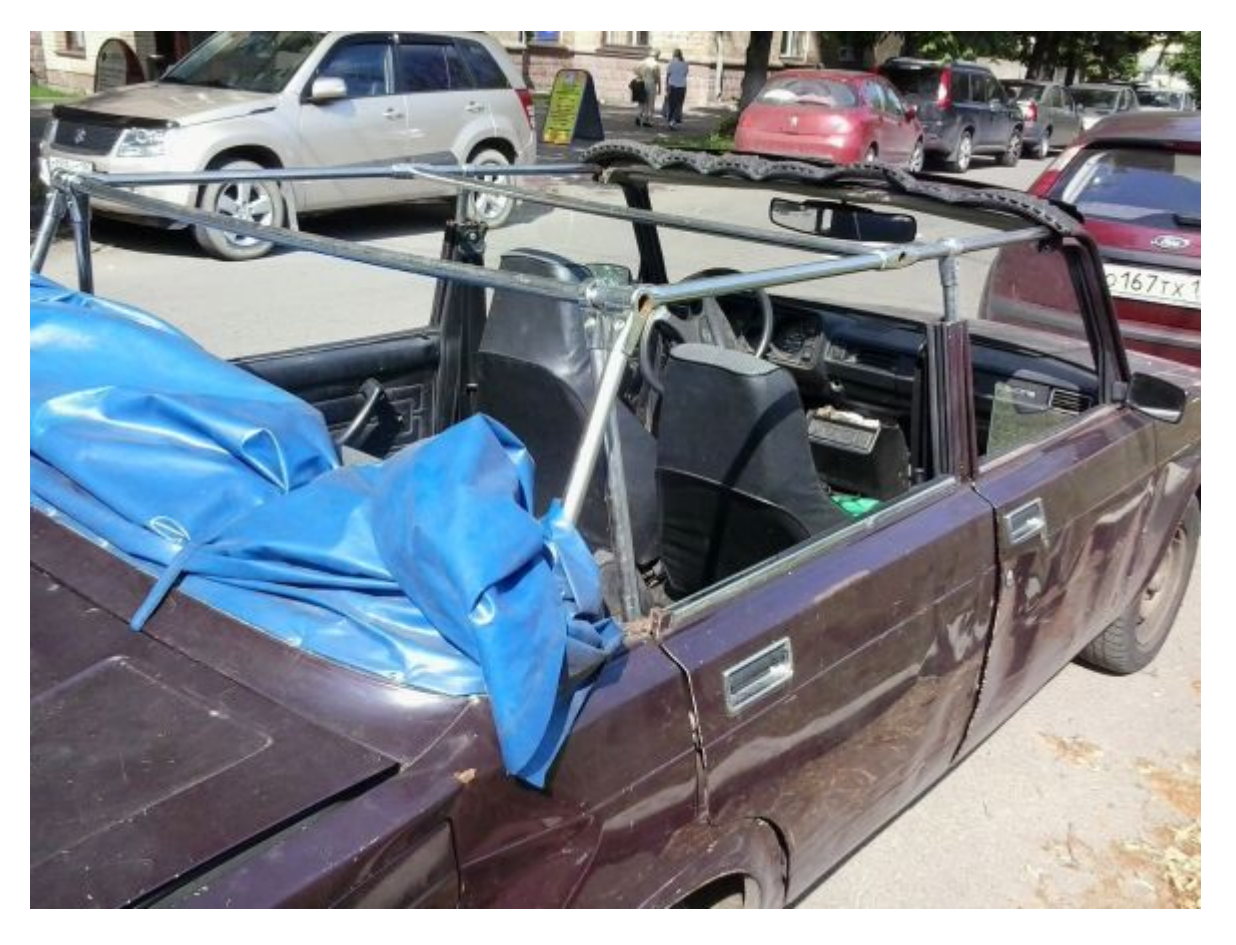
And I love Russia for the humor and ingenuity of turning a Zhiguli into a makeshift convertible.

So, if a Russian is not smiling at me, perhaps they are not happy to see me. This takes out loads of guesswork in relationships.