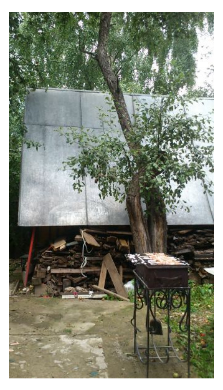
And I love Russia for the shashlik followed by a steaming hot banya.

5) Extreme. Sometimes it seems that everything in Russia is being done in the most extreme