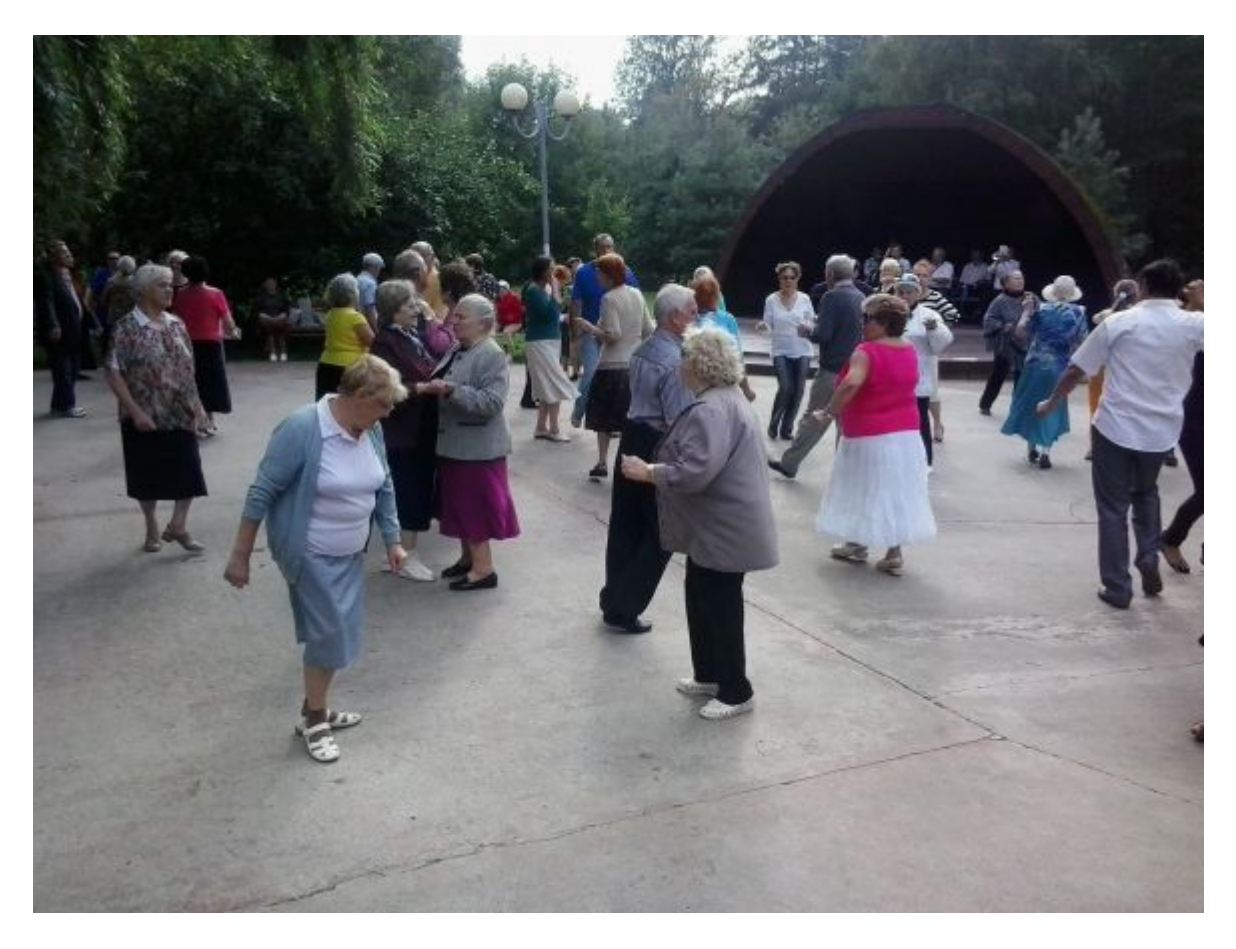
I love Russia for weekend dancing in the park to the music of a live brass band.

Nearly invariably, when I meet a Russian Person for the first time, they ask, "Why do you live in Russia?" This question is often fraught with deep suspicion that there could be no pure motivation for an American to live in Russia.