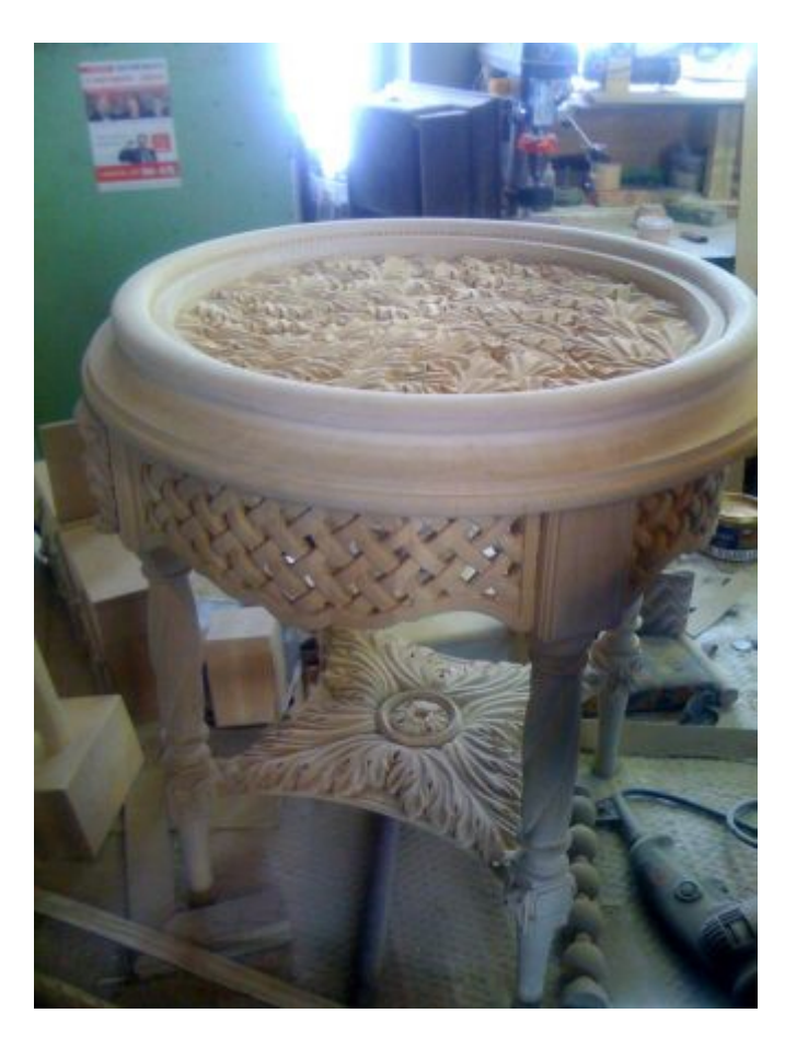
I love Russia for the "golden hands" of the master woodcarver.

Long story short, a few minutes later, The Luggage Owner and I were hugging, and soon after, my mother and I were on our way. I was surprised to run over a Special Skiing Suit, and I was surprised that this interaction did not end up in fisticuffs. I was surprised that picking up my mother at the airport included Hugging A Russian Man.