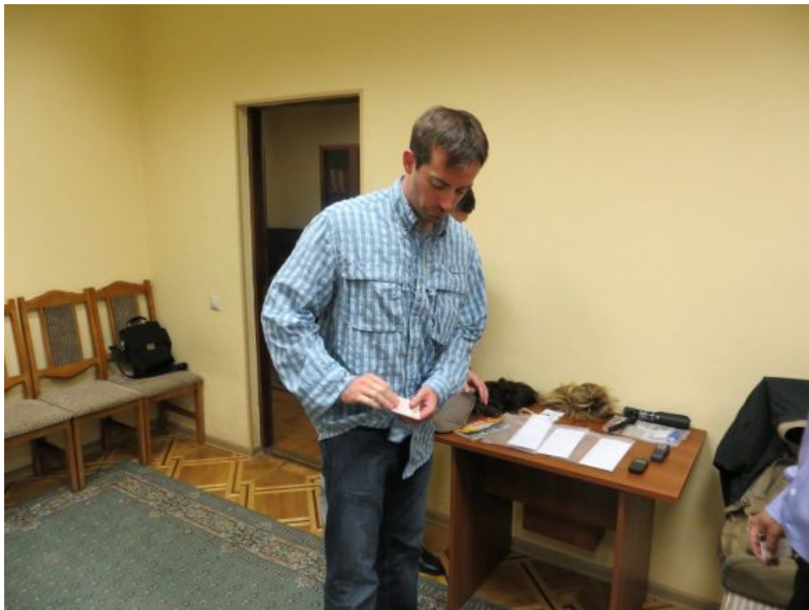
Ryan Fogle pictured in May with two wigs at an FSB office. The wigs could come in handy.

1. Get a haircut and a change of clothes. Even a few hours lugging bags and chasing the right gate in that transit zone of Sheremetyevo Airport can leave the hardiest traveler grizzled and pungent.