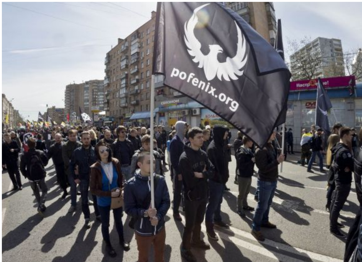
Check out an opposition group like this one, which backs political prisoners at a May rally.

6. Just for fun, join a nongovernmental organization or opposition party and help the group develop its moral outrage strategy as well as its surveillance countermeasures.