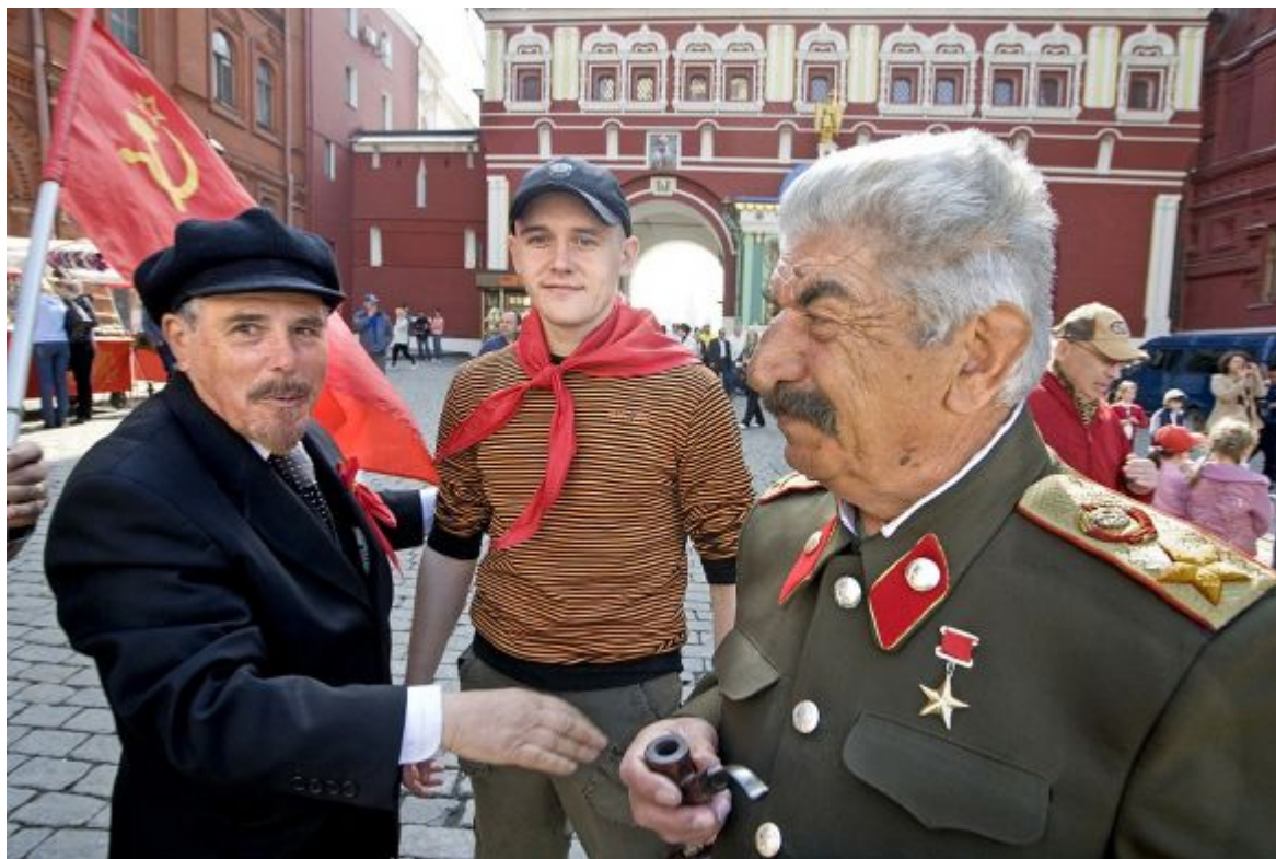
Get your photo taken with a Lenin or Stalin lookalike.

6. Just for fun, join a nongovernmental organization or opposition party and help the group develop its moral outrage strategy as well as its surveillance countermeasures.