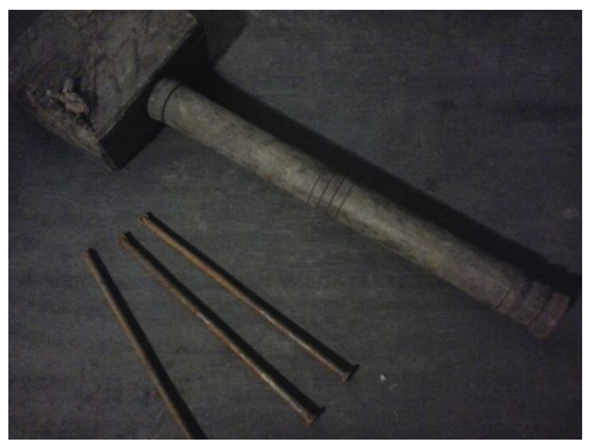
You know, instead of glue.

Actually, if you think gluing is the only way to fasten this fine product to another surface, you are guilty of an incredibly paltry worldview and are in deep need of broadening your horizons. One time I was part of purchasing a house in a small village in a remote area of Russia. We were fascinated to discover that they had nailed the wallpaper to the wall. I never found out why, and that is something that keeps me up at night. The possible explanations include: 1) There was no glue available. OR 2) If there was ever the need to move quickly, due to an unforeseen cataclysmic event, you could quickly remove the wallpaper and take it to your new residence under the cover of the darkness of the early morning hours.