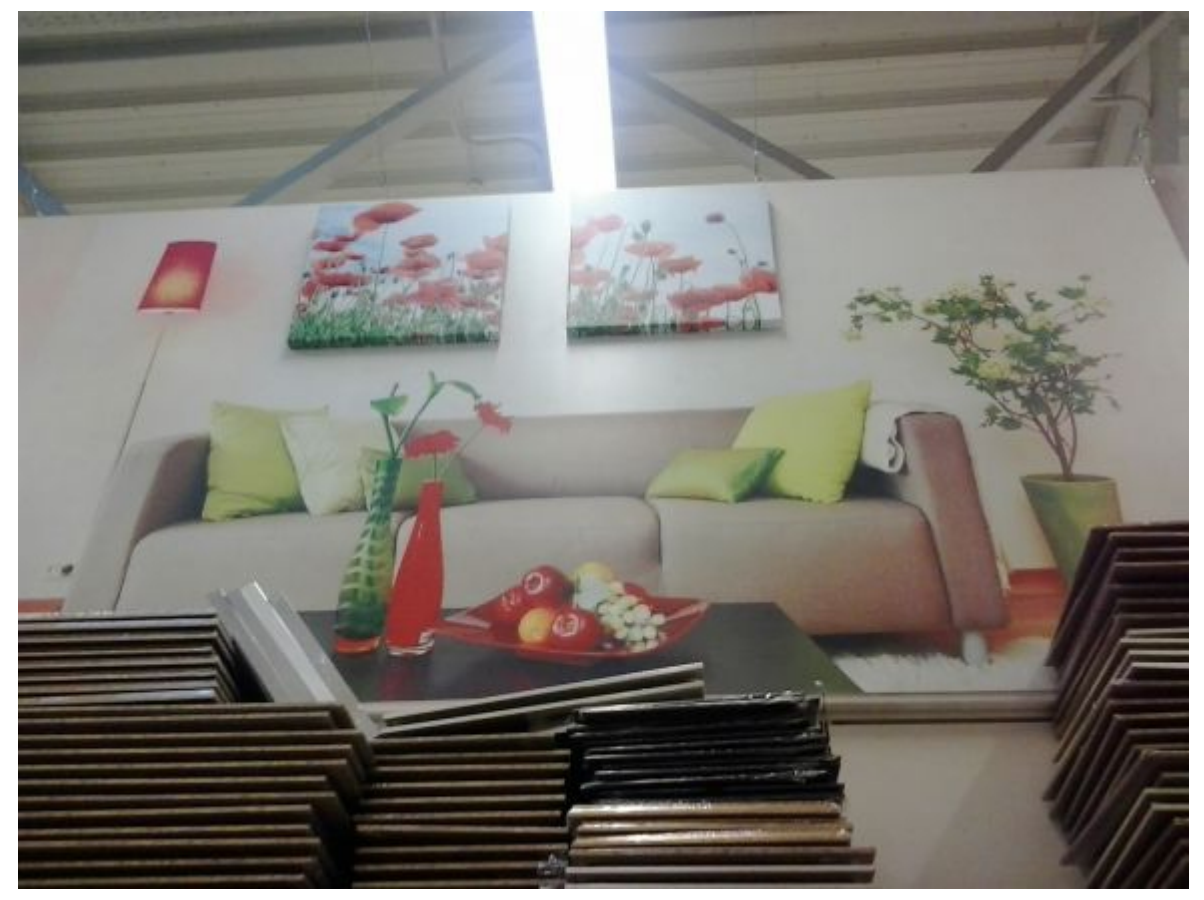
Create the illusion that you can afford furniture and fruit.

Since my daughter stumped me this morning, I turned to social media to answer this question. Whenever I don't know what to do with life's big questions I always turn to <u>Twitter</u>. One of my followers (I lead, he follows) was kind enough to explain to me that "during Soviet times, wallpaper on the ceiling was a sign of prosperity".