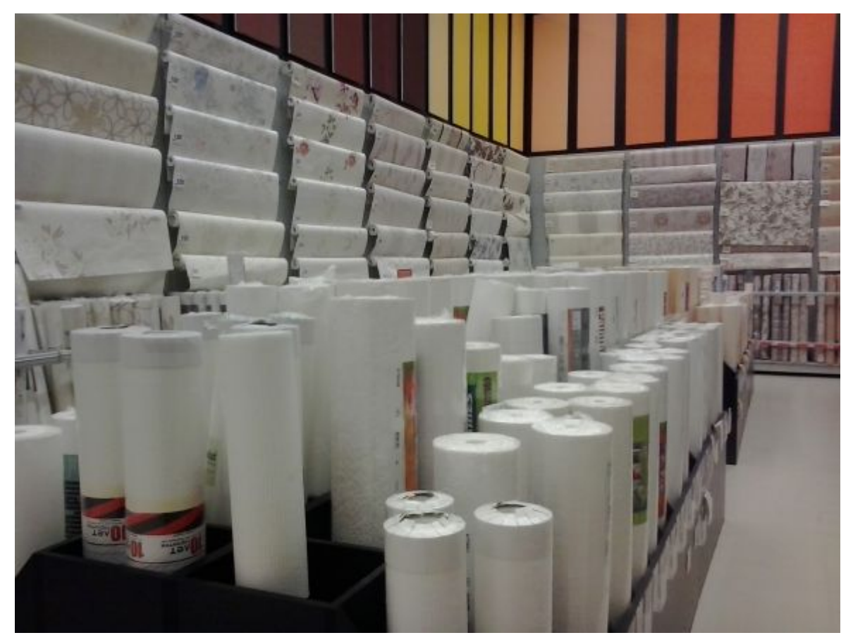
So much wallpaper, so few ceilings.

She's a sensible yet respectful young lady, so I can only assume that's why she didn't begin to riddle holes into my very incomplete explanation. Indeed, I have scratched a whitewashed ceiling or two in my day with a Christmas tree star, and have witnessed the need to perpetually update the ceiling whitewash. But still, there must be a better solution?