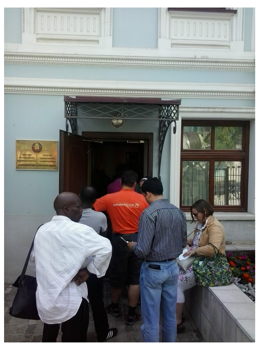
An International Queue of Belarus Visa Hopefuls

1. Throw Out Your Understanding of Personal Space. If you can tell me what a good Russian word for privacy is, I will hire you as my translator. With that aside, allow me to assure you that as you Occupy The Queue, In Russian, your personal space does not extend beyond your epidermis. Indeed, if you are not in physical contact with the person sequentially in front of you in the queue, then you are not occupying the queue and stepping in front of you is completely and culturally acceptable. Sadly, this has caused me some shame in fast food establishments in my motherland as I forget where I am. There, those Americans with their white sneakers, big smiles, and "how are you's", spread out all over the floor of Bojangles. I step right up to the cash register and the smiles and "how are you's" quickly turn to Operation Shock and Awe, and I put my theoretical tail between my legs and quickly retreat. Honestly, an aircraft carrier could have easily slipped between the cash register and the so-called first person in line. In Russia, do you feel like an outsider? Go stand in a line. You will get over it.