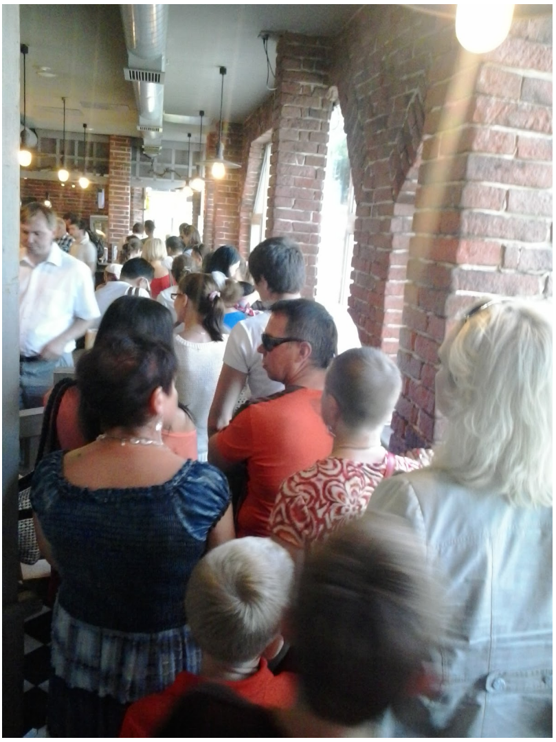
Hungry Lunch Queue Formation

3. Make A List. This is especially useful for lines that are 4 hours long and longer. Inevitably, a