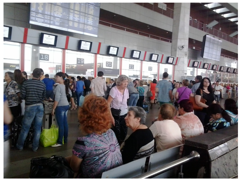
Multiple Simultaneous Queue Occupation Strategy Situation

however. This is a virtual minefield of technical and lunch breaks. I think technically all breaks are used for the same thing. Also, please bear in mind that all train stations use Moscow time. I think that sentence was supposed to be "all train stations in Russia use Moscow time", but probably some outside of Russia also use Moscow time. In any case, this explains why train station workers in Khabarovsk eat lunch at 10:00 p.m., technically. The trick is to calculate how long it will take the ticket lady (no, I'm not sexist, it is a lady) to make tickets for the 15 people in front of you and if in fact that is enough time before the dreaded technical break.