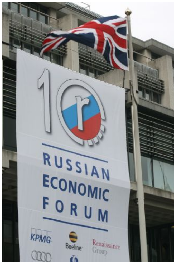
A banner welcoming investors to the 10th Russian Economic Forum in London.