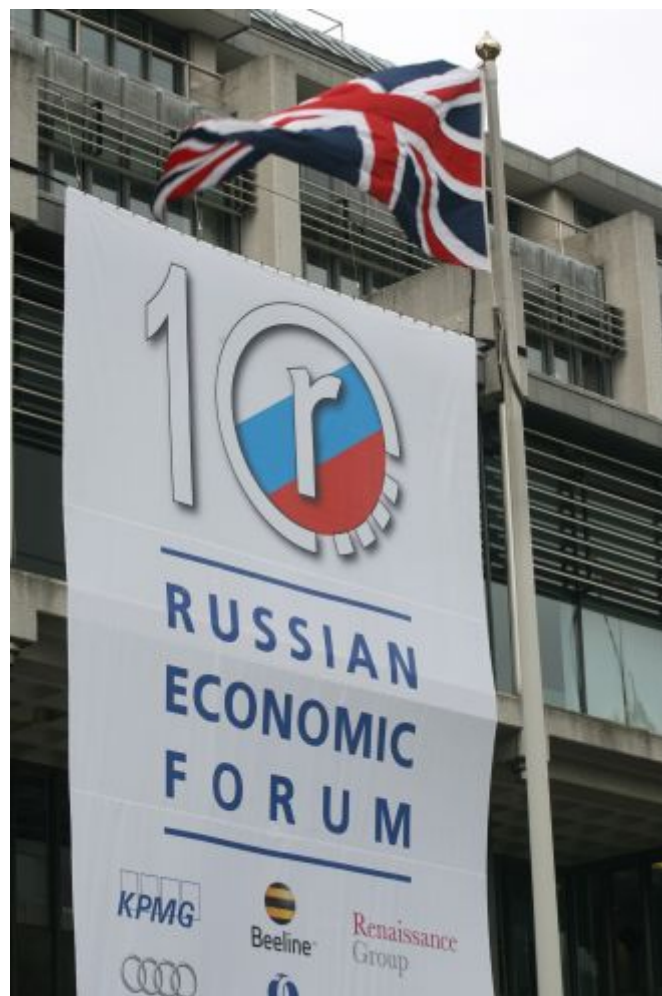
A banner welcoming investors to the 10th Russian Economic Forum in London.

Voina faded from the public spotlight in 2011 — the same year that two members of its Moscow branch, Nadezhda Tolokonnikova and Yekaterina Samutsevich, teamed up to help form the female punk group Pussy Riot.