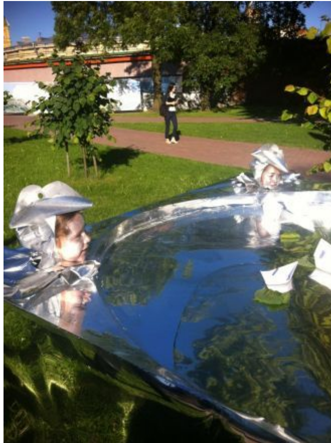
Girls blowing into the sails of ships at the St. Petersburg governor's reception in 2012.