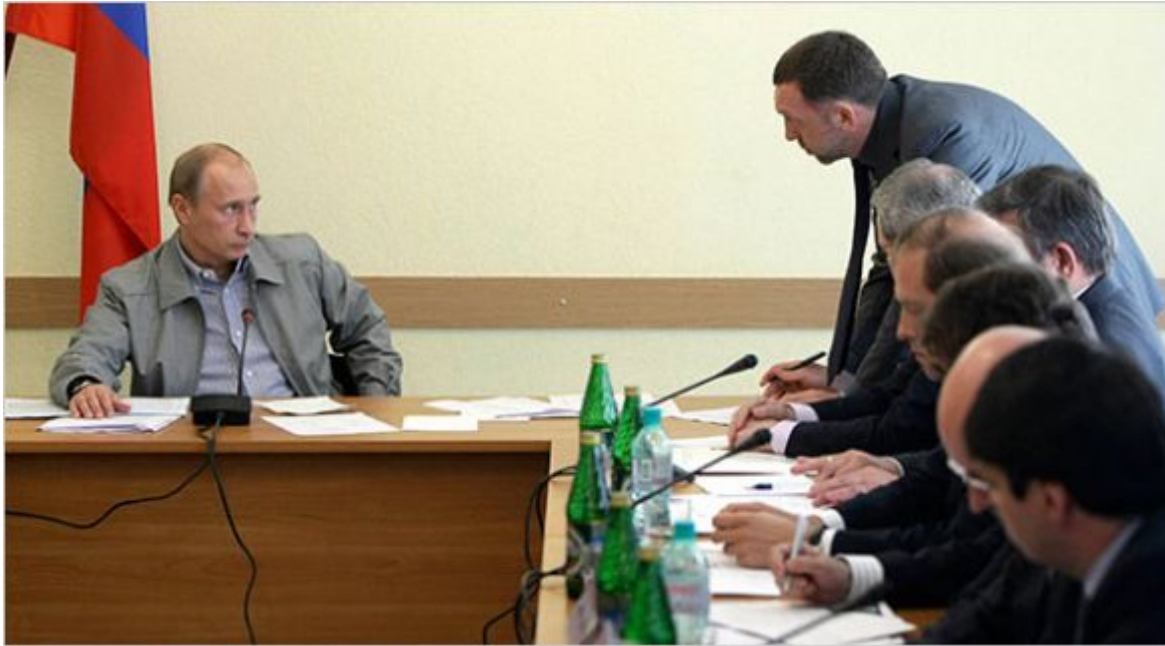
Vladimir Putin reprimanding Oleg Deripaska, standing, in Pikalyovo in June 2009.

"The city only gave the financing. The responsibility lies with the victor in the tender," a city spokesman said.