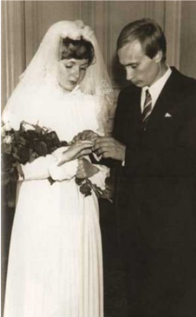
Vladimir Putin tying the knot with Lyudmila Shkrebneva on July 28, 1983.

Putin announced Thursday that he was getting a divorce after 30 years of marriage.