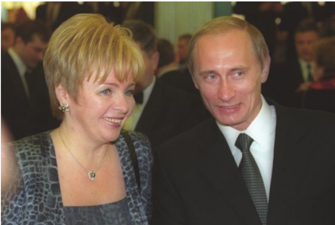
Putin and Lyudmila attending a party after his inauguration at the Grand Kremlin Palace on