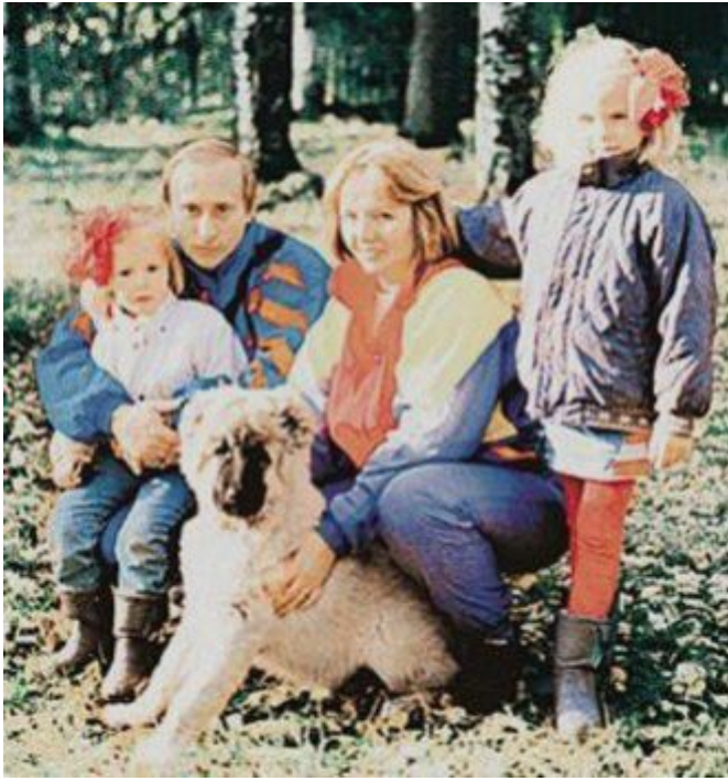
The Putin family in an undated photo.