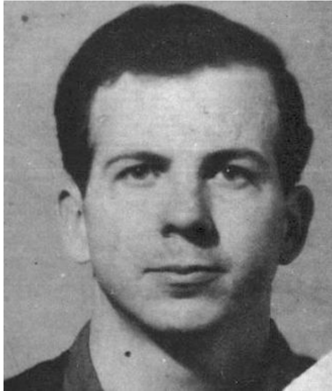
Lee Harvey Oswald in Belarus.

In a letter to The Buffalo (New York) News, McVeigh had said he wanted his ashes scattered at a secret location.