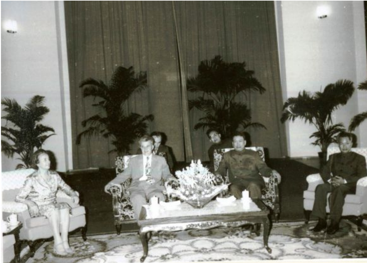
Pol Pot, center right, meeting Romanian President Nicolae Ceaucescu in 1978.