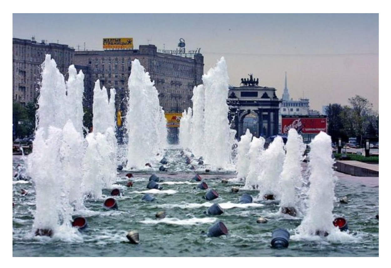
The Poklonnaya Gora fountain pumps out about 15 million liters of water at a time.