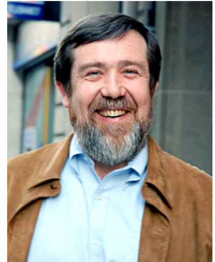
For MT Pazhitnov